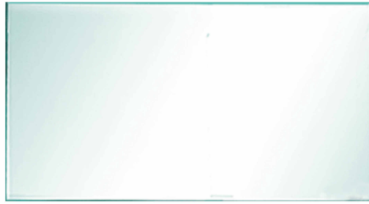
RAILING: GL-02 CLEAR GLASS RAILING SYSTEM