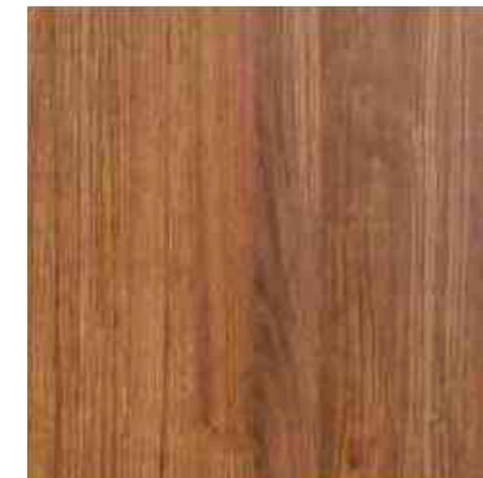
ACCENT: WD-02 REALISTIC WOOD FINISH ALUMINUM SYSTEM COLOR: BASED ON SCULPTFORM : NORTHERN SPOTED GUM (OR SIMILAR)