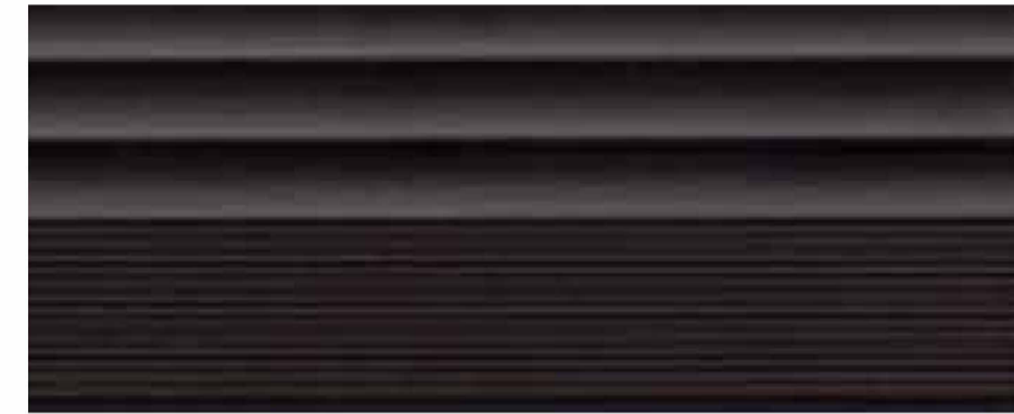
STOREFRONT FRAME: DARK ANODIZED ALUMINUM BASED ON ARCADIA AB-7 STANDARD DARK BRONZE (OR SIMILAR)