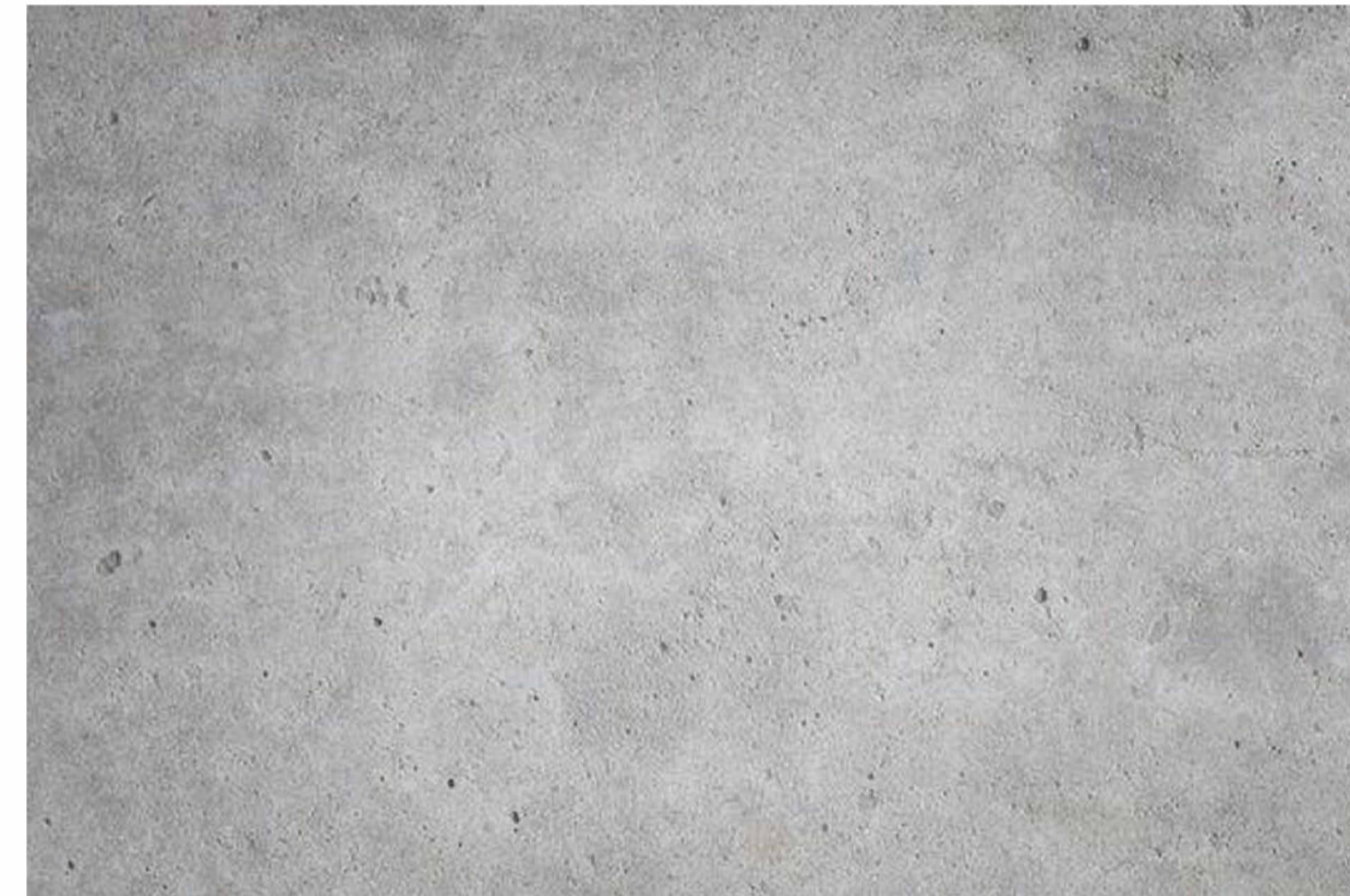
ACCENT: CONC-03 SMOOTH CONCRETE