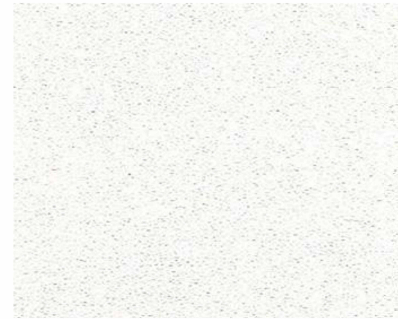
FIELD: CONC-01 E.I.F.S. SYSTEM: BASED ON DRYVIT 396 - ALABASTER (OR SIMLAR)