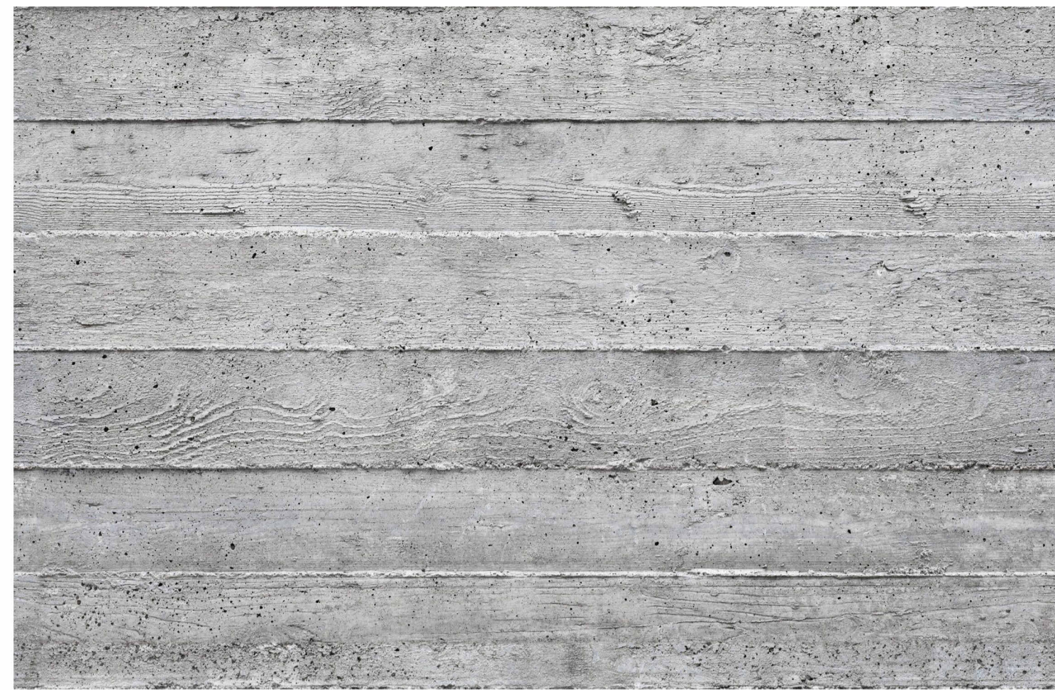
ACCENT: CONC-02 BOARDFORM CONCRETE