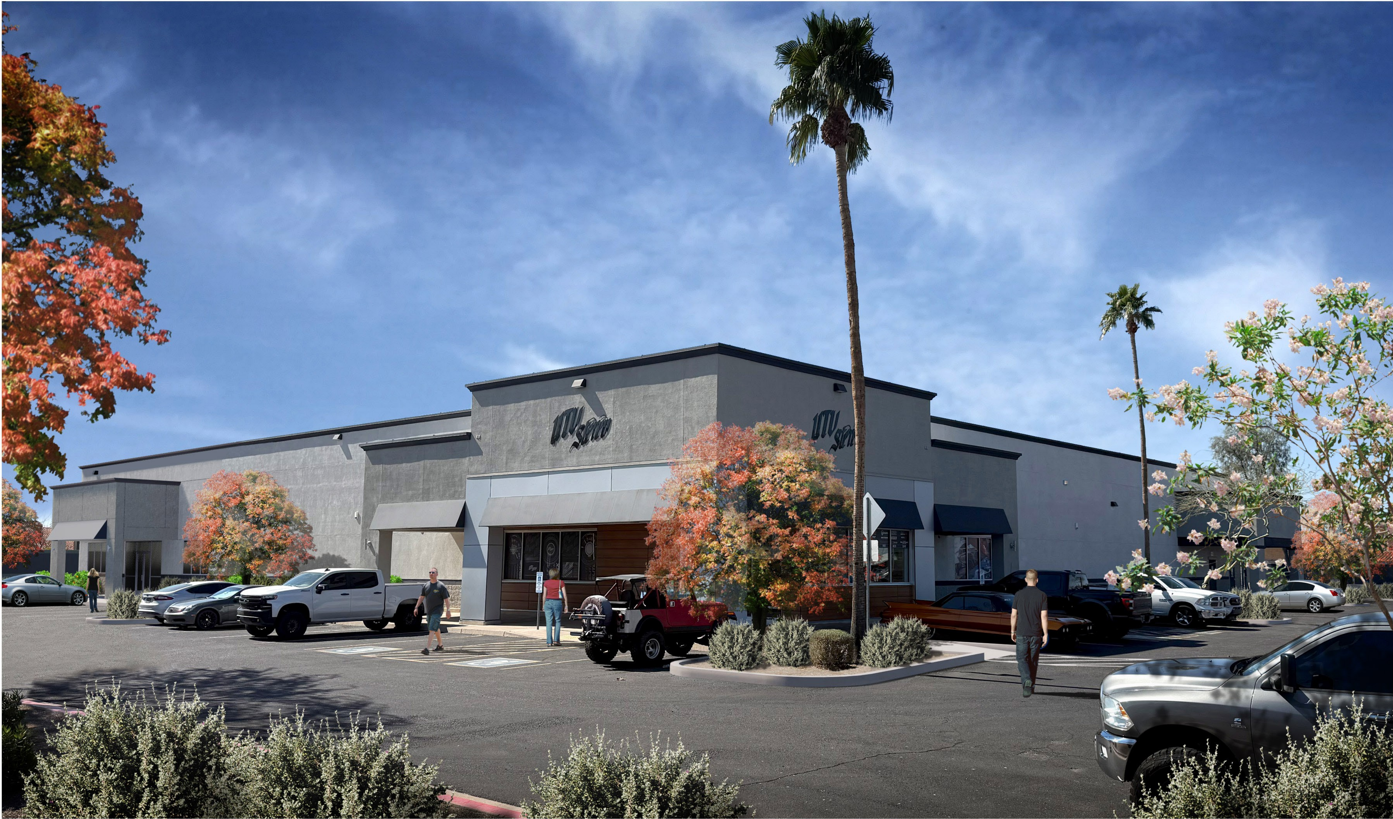
Artistic depiction only. Colors and materials represented may vary from actual samples. Not to be referred to as a construction document.