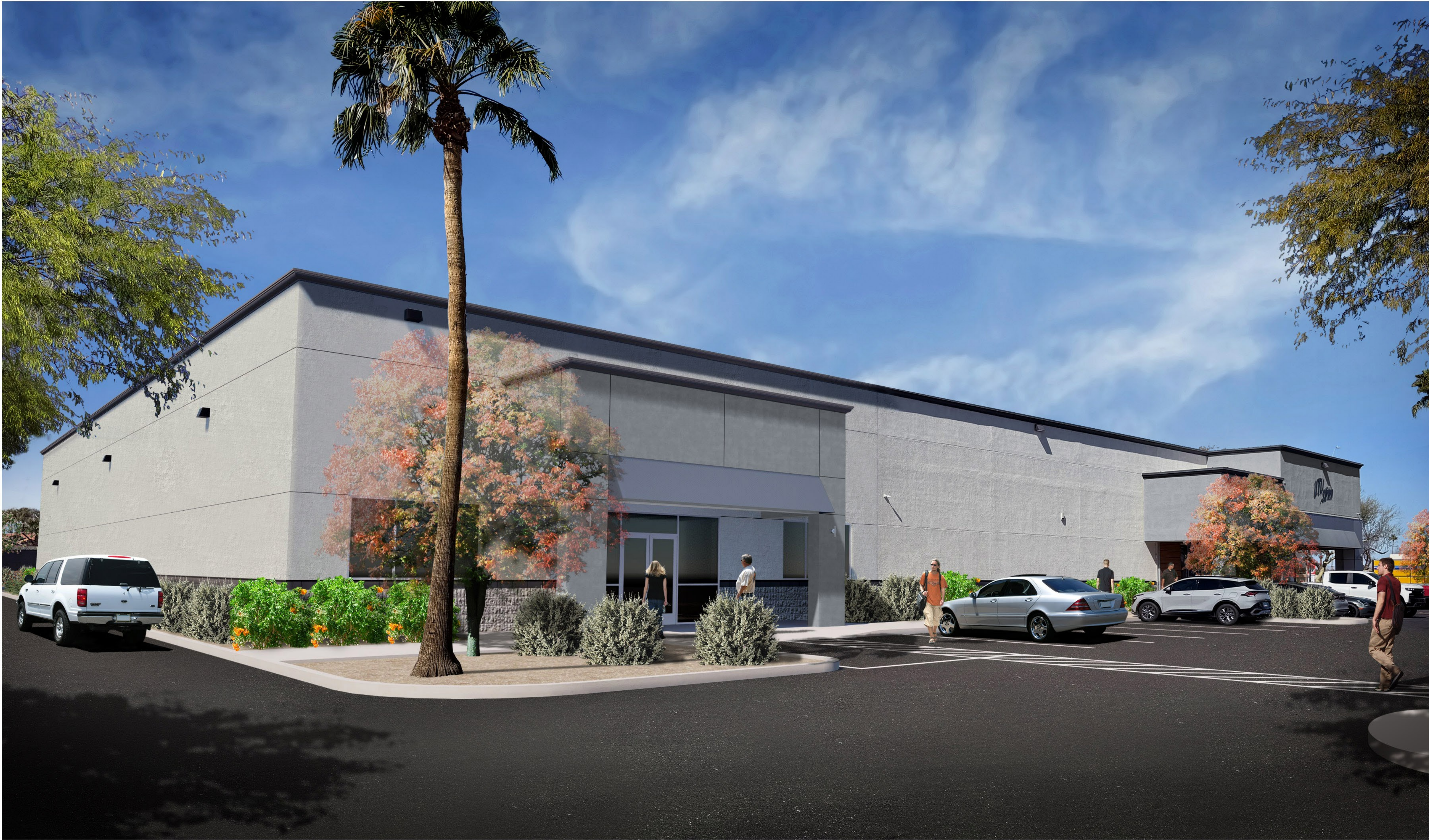
Artistic depiction only. Colors and materials represented may vary from actual samples. Not to be referred to as a construction document.