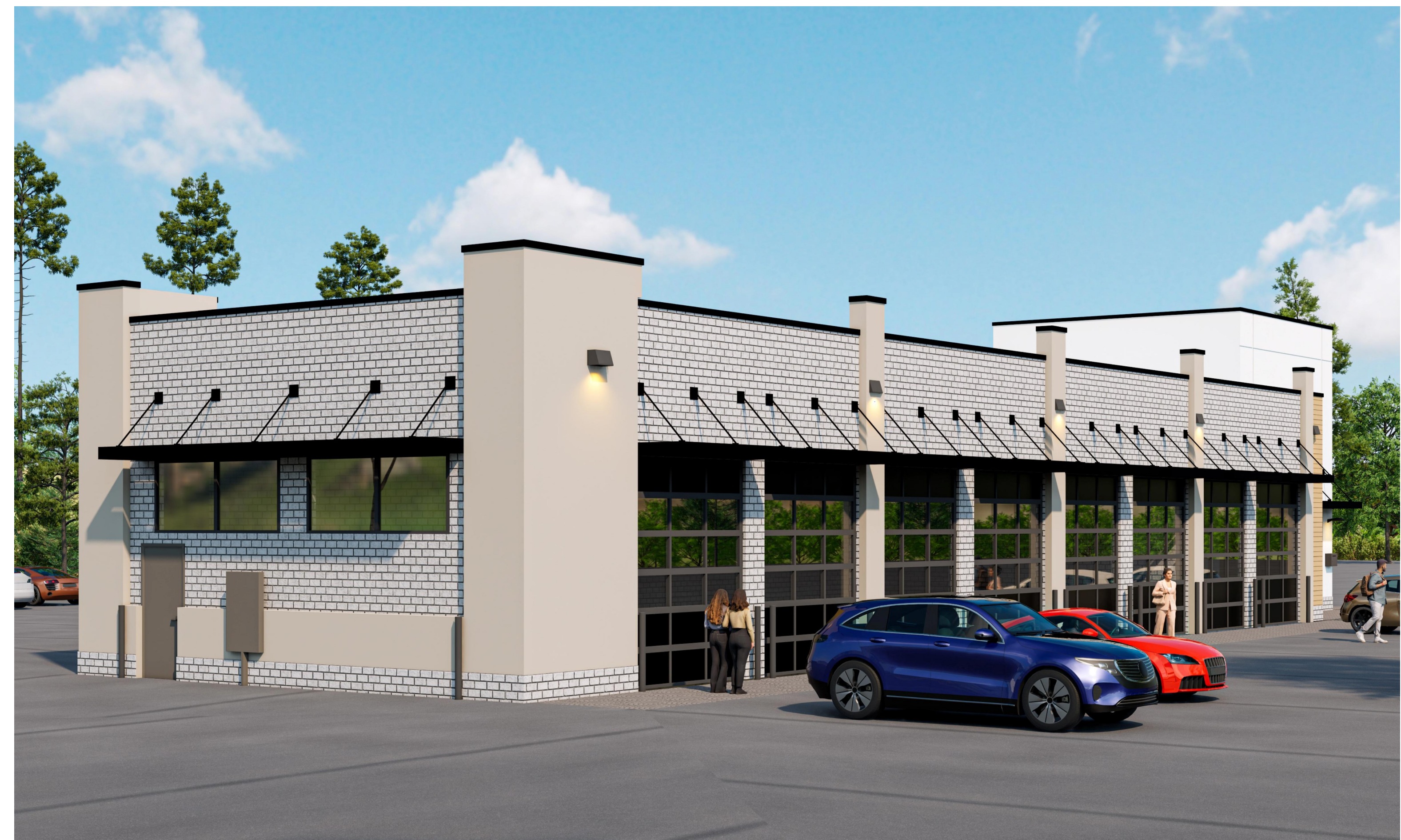
VIEWING NORTHEAST AT THE BLDG.