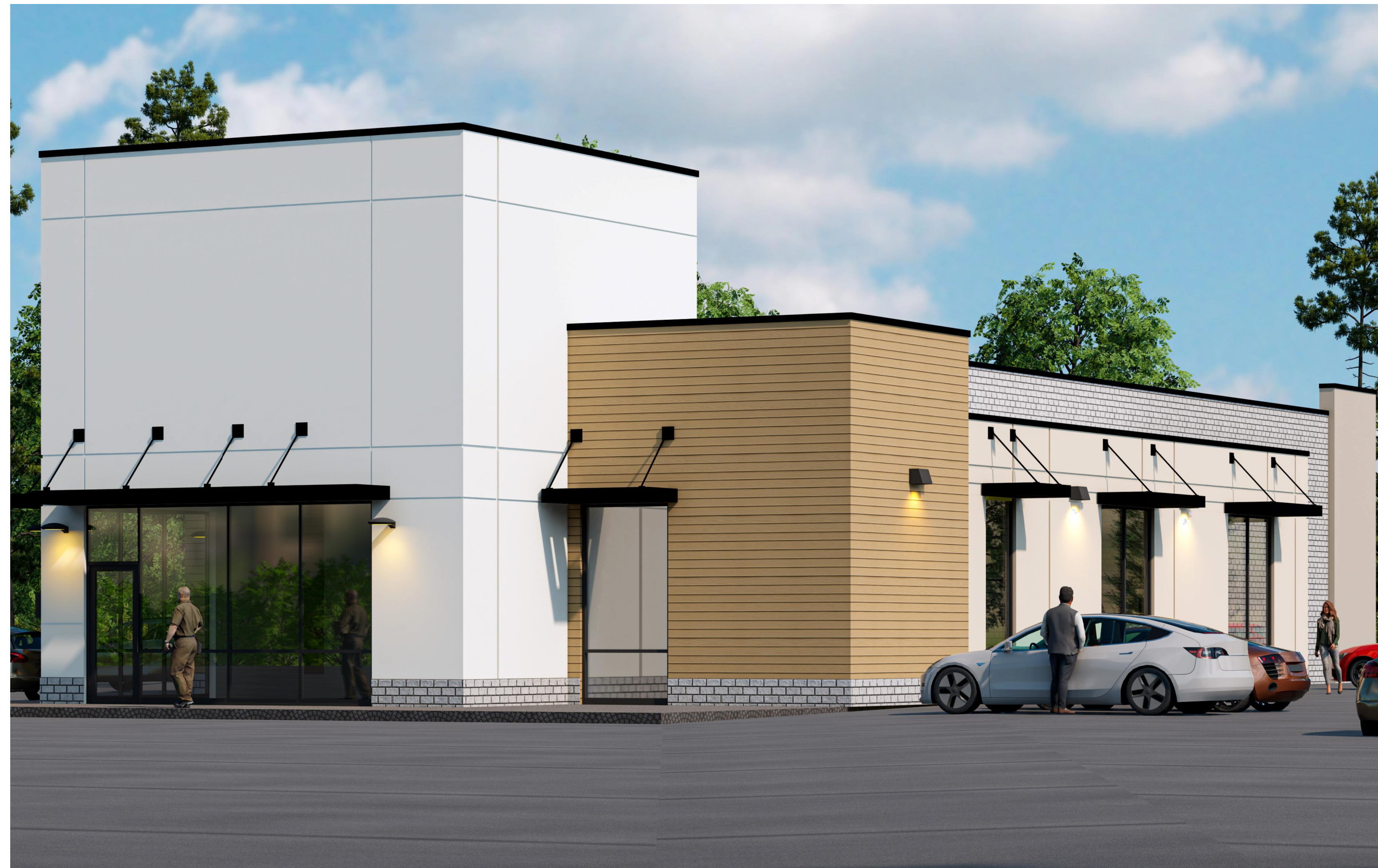
VIEWING SOUTHWEST AT THE BLDG.