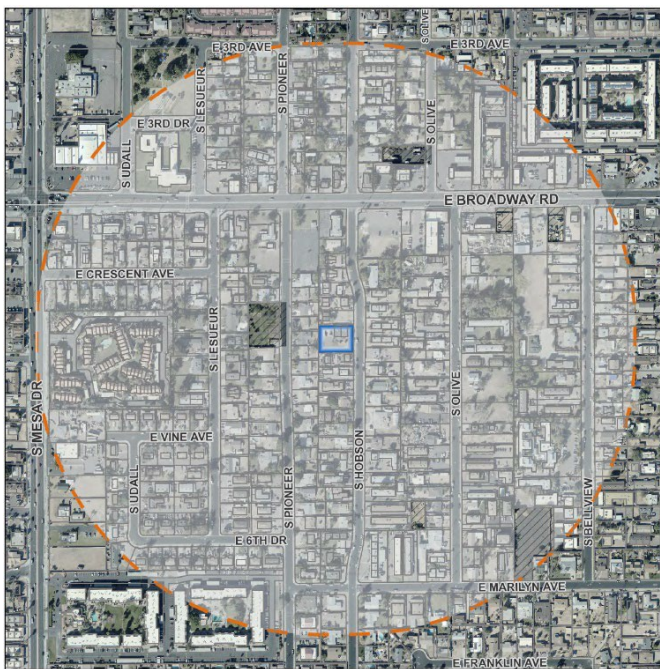
15-year Historical Aerial Photo