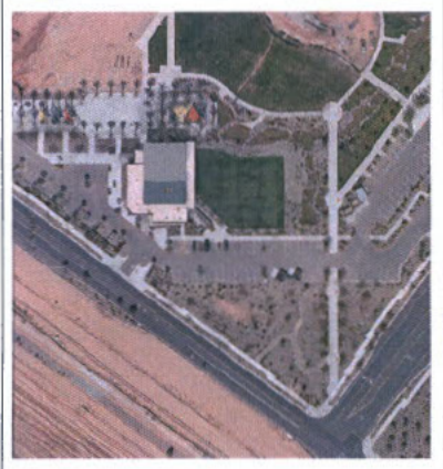
EXISTING SITE PHOTO

Series 15 alcohol event area coverage (261,894 sqft)