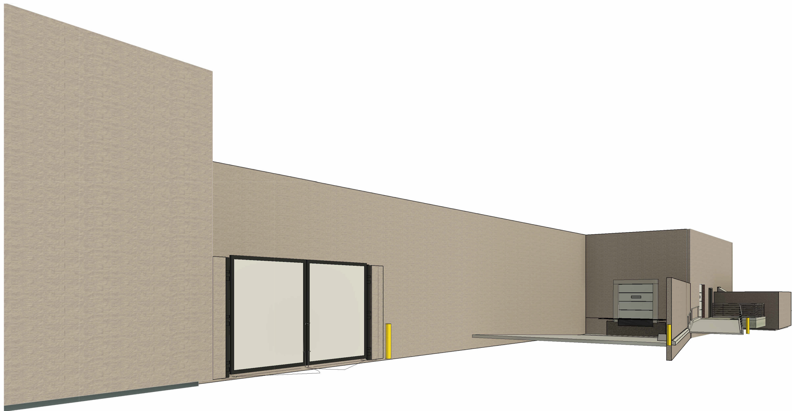
4 BUILDING PERSPECTIVE 4