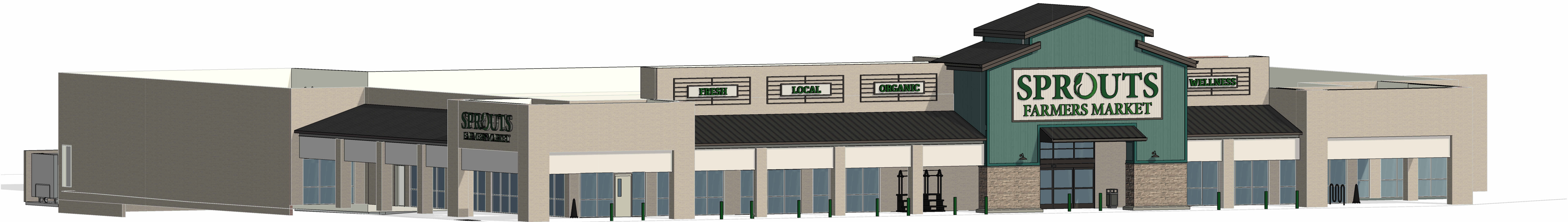
1 BUILDING PERSPECTIVE 1