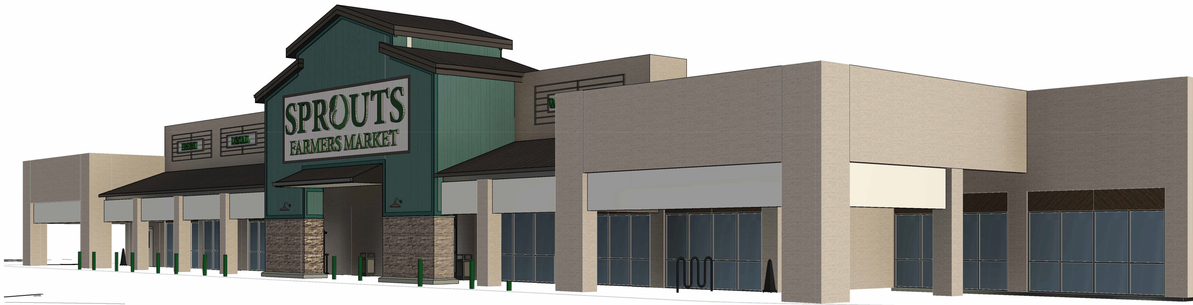
2 BUILDING PERSPECTIVE 2