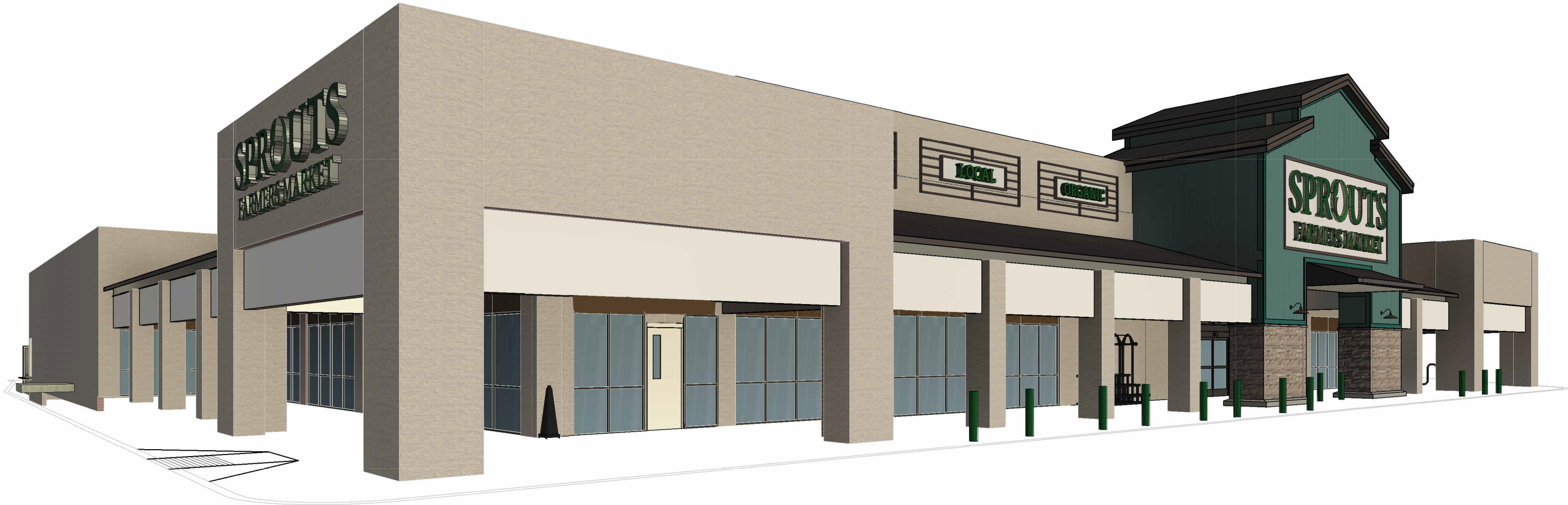
3 BUILDING PERSPECTIVE 3