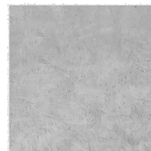
Light Grey -Stucco