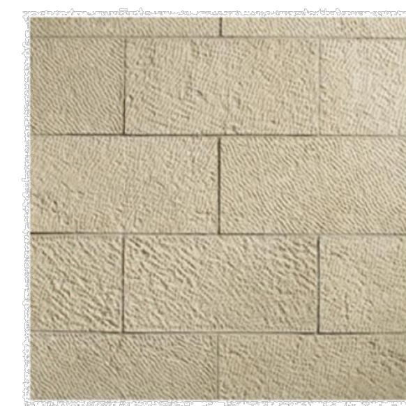
Kakwa stone biscuit-craft-chiseled-rectangle