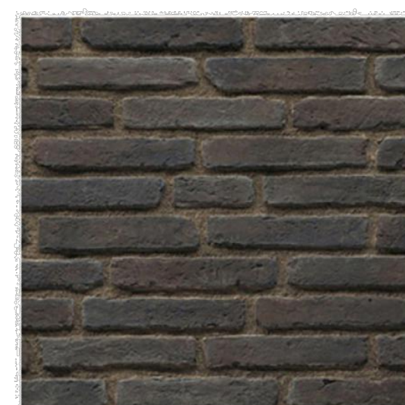
Ferrara Dark Grey Manufactured Stone Handmade Brick Veneer