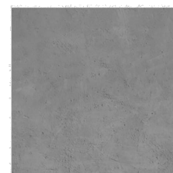
Dark Grey -Stucco