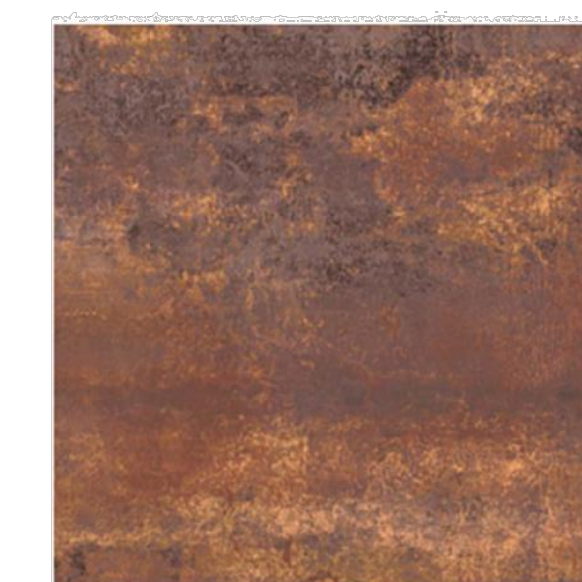
Corten Rusted Steel