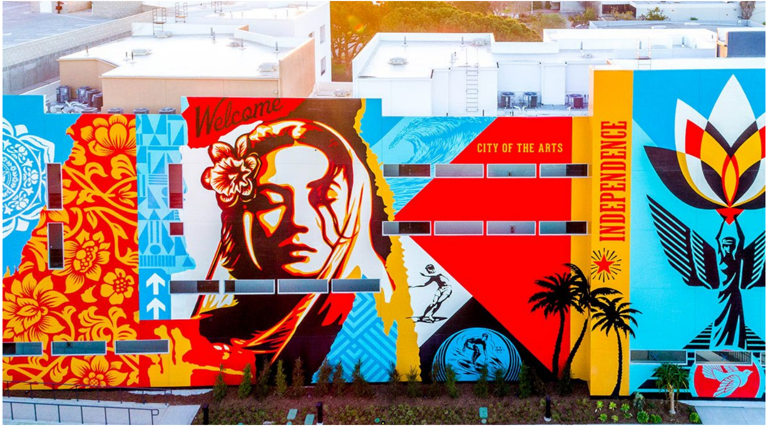
"Welcome Home" Mural by Shepard Fairey Painted on Baker Block Costa Mesa, CA Completed in 2018