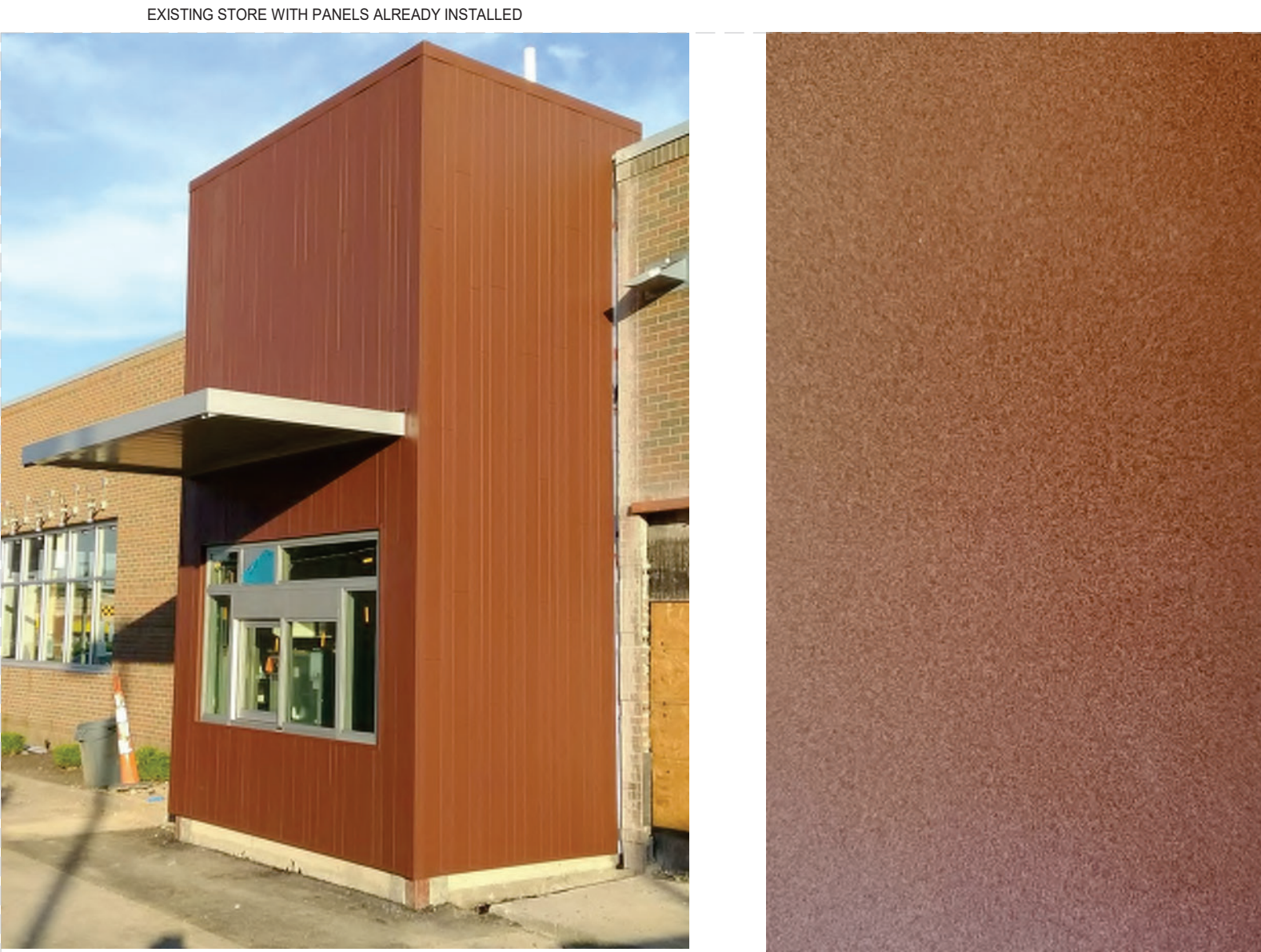
EXISTING STORE WITH PANELS ALREADY INSTALLED ARCH FAB METAL PANELS - 'RUSTIC'