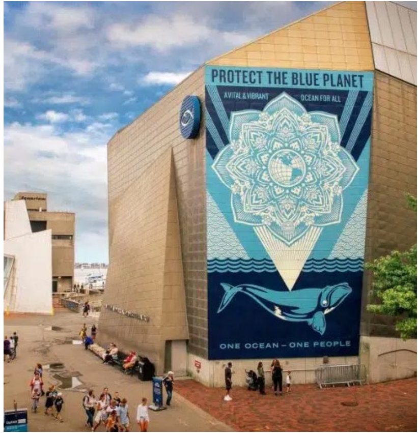
A Vital and Vibrant Ocean for All, 2021 Simons Theatre at the New England Aquarium, Boston, MA