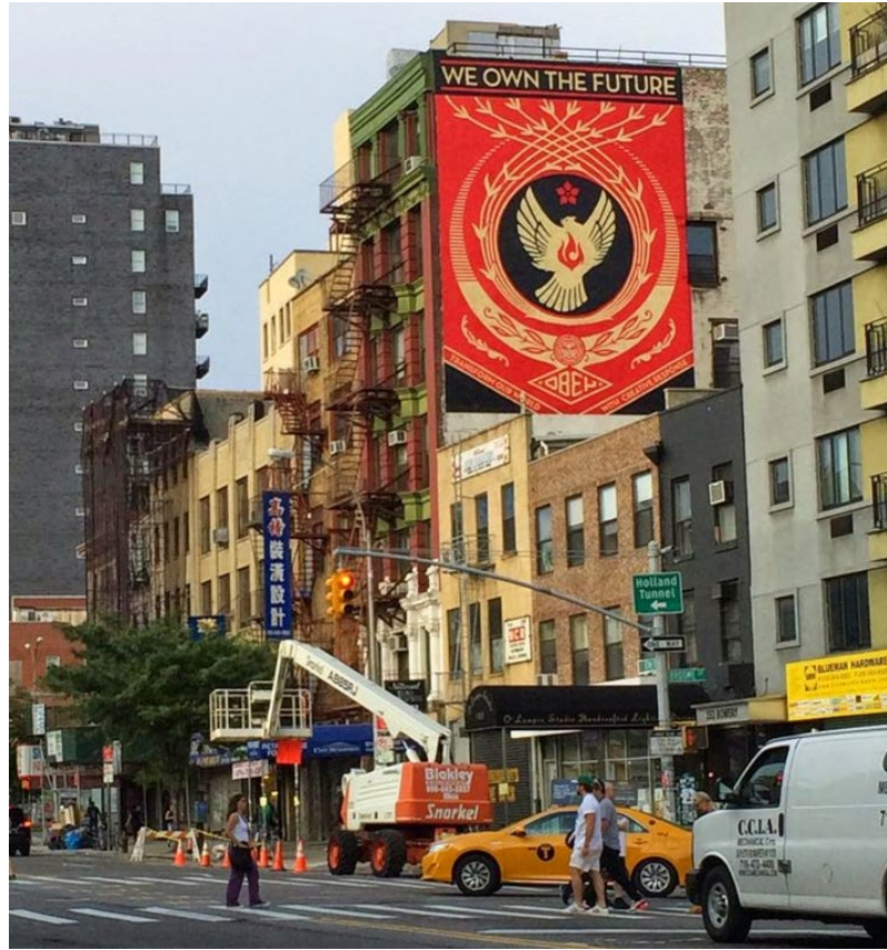
We Own the Future, 2014 Little Italy, New York, NY