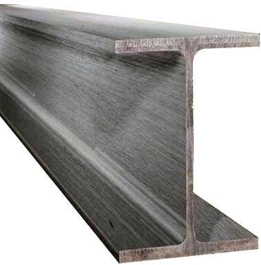
"1" BEAM PROFILE