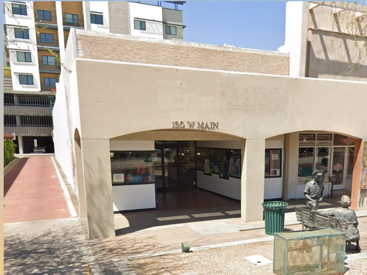
Looking north from Main Street