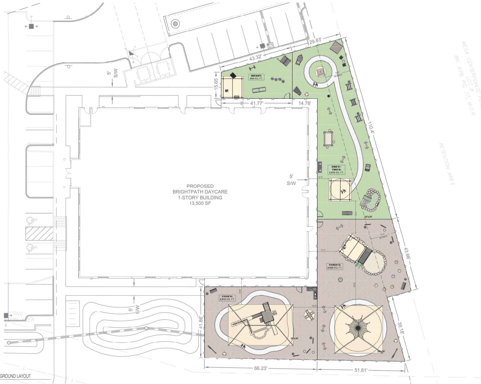
1 PROPOSED PLAYGROUND LAYOUT SCALE 3/4" = 1'-0"

MESA CENTERPONTI PLAZA LOT 8 BK. 978, PG. 57, M.C.R.