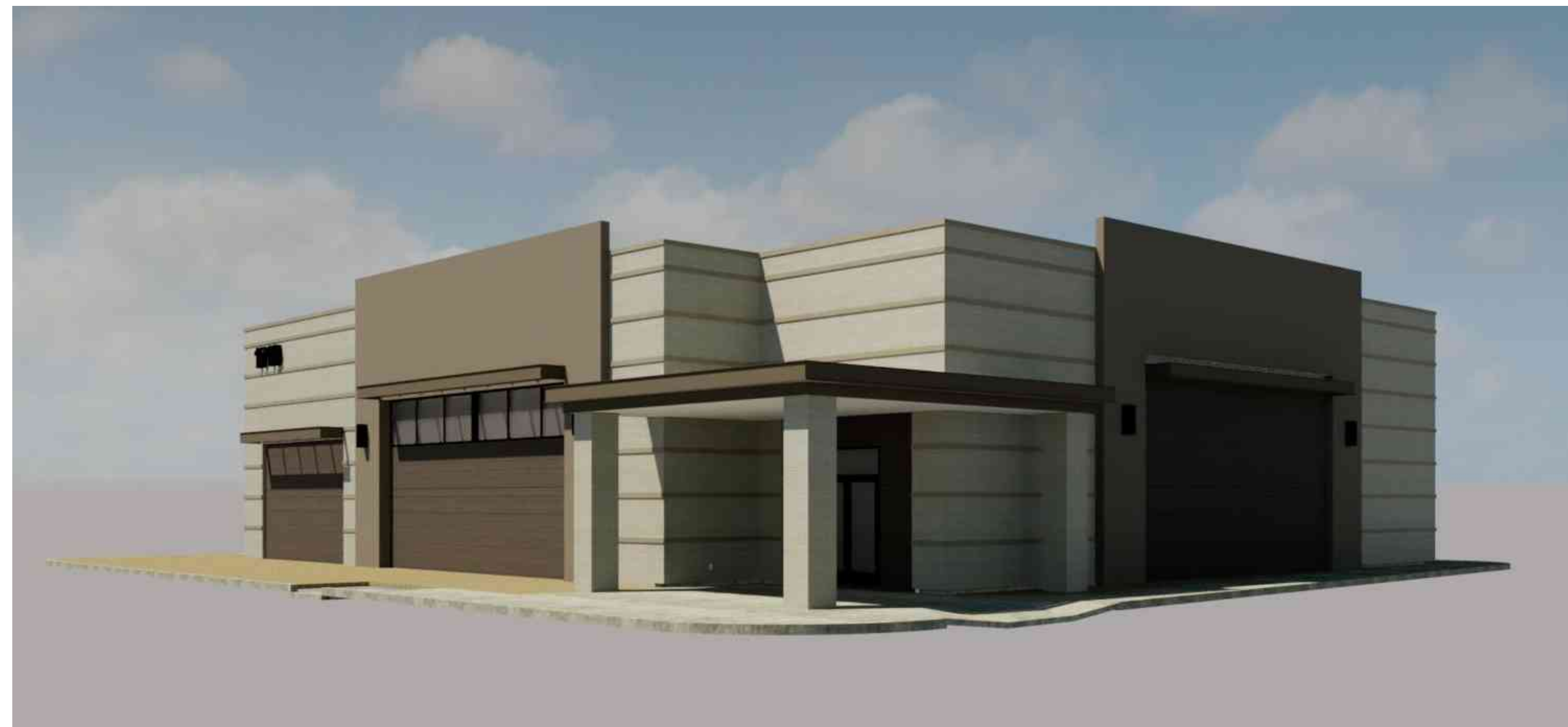
SE CORNER VIEW