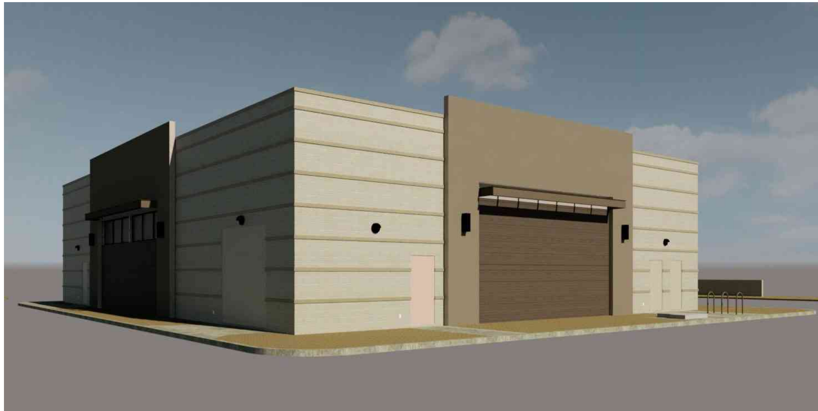
NW CORNER VIEW