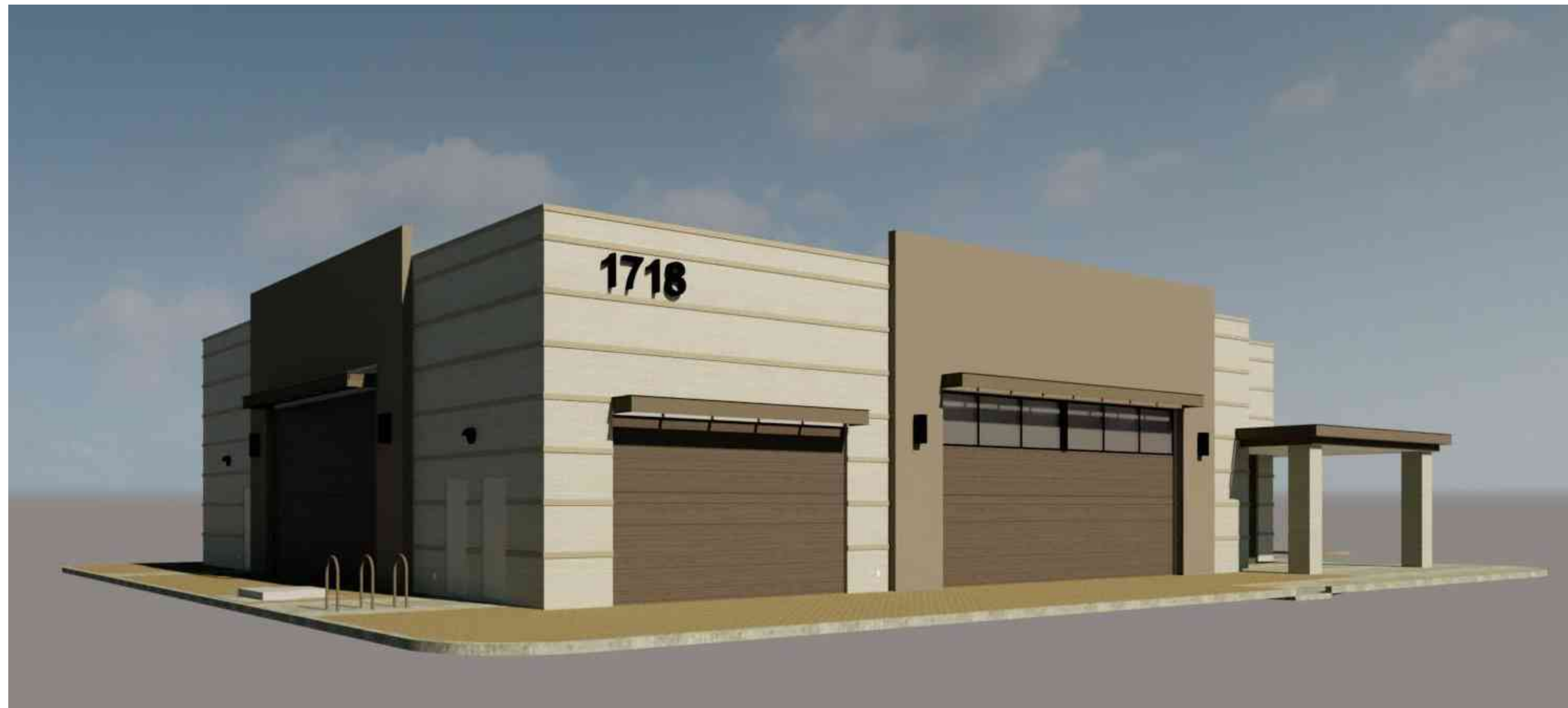
SW CORNER VIEW

F:\Dropbox\Projects\2024\VAI2421 New Life Bldg\01 PLANS\RV\2421 NEW LIFE CD 02-16-26.rvt 2/26/2026 4:48:35 PM Plot Date: