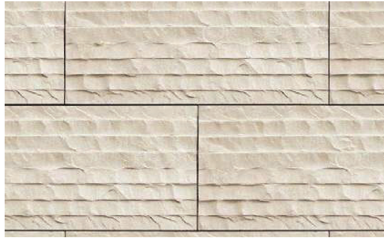
ST-5 - MANUFACTURED THIN STONE VENEER