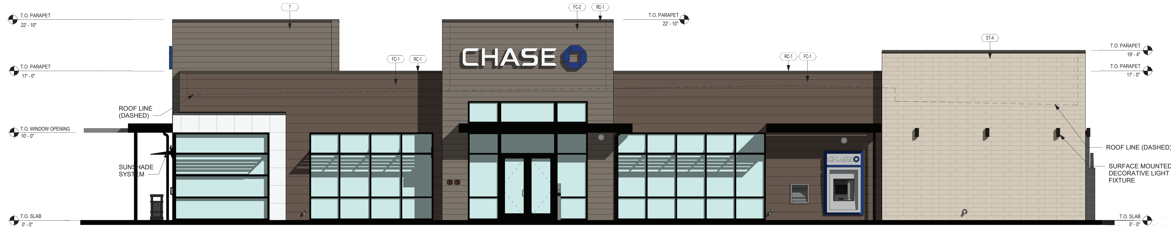
1 NORTH ELEVATION A2.4 SCALE: 3/16" = 1'-0"

PRELIMINARY - NOT FOR CONSTRUCTION NOR RECORDING