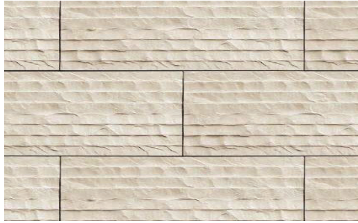
ST-4 - MANUFACTURED THIN STONE VENEER

THIS DRAWING IS PROVIDED AS AN INSTRUMENT OF SERVICE BY APM ARCHITECTURE AND IS INTENDED FOR USE ON THIS PROJECT ONLY. THE DRAWING REMAINS THE PROPERTY OF APM ARCHITECTURE AND SHALL BE RETURNED TO THEM UPON COMPLETION OF THE CONSTRUCTION WORK. PURSUANT TO THE ARCHITECTURAL WORKS COPYRIGHT ACT OF 1990, ALL DRAWINGS, SPECIFICATIONS, NOTES AND DETAILS ARE THE PROPERTY OF APM ARCHITECTURE. ANY REPRODUCTION, DISTRIBUTION, OR DISSEMINATION OF THIS DRAWING WITHOUT THE WRITTEN CONSENT OF APM ARCHITECTURE IS STRICTLY PROHIBITED. © 2023 APM ARCHITECTURE