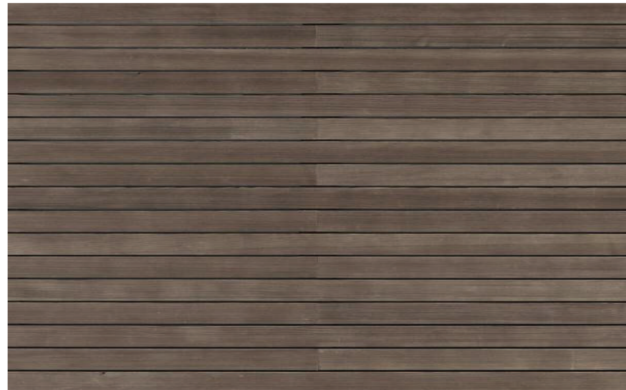
FC-1 - FIBER CEMENT PANEL - DARK