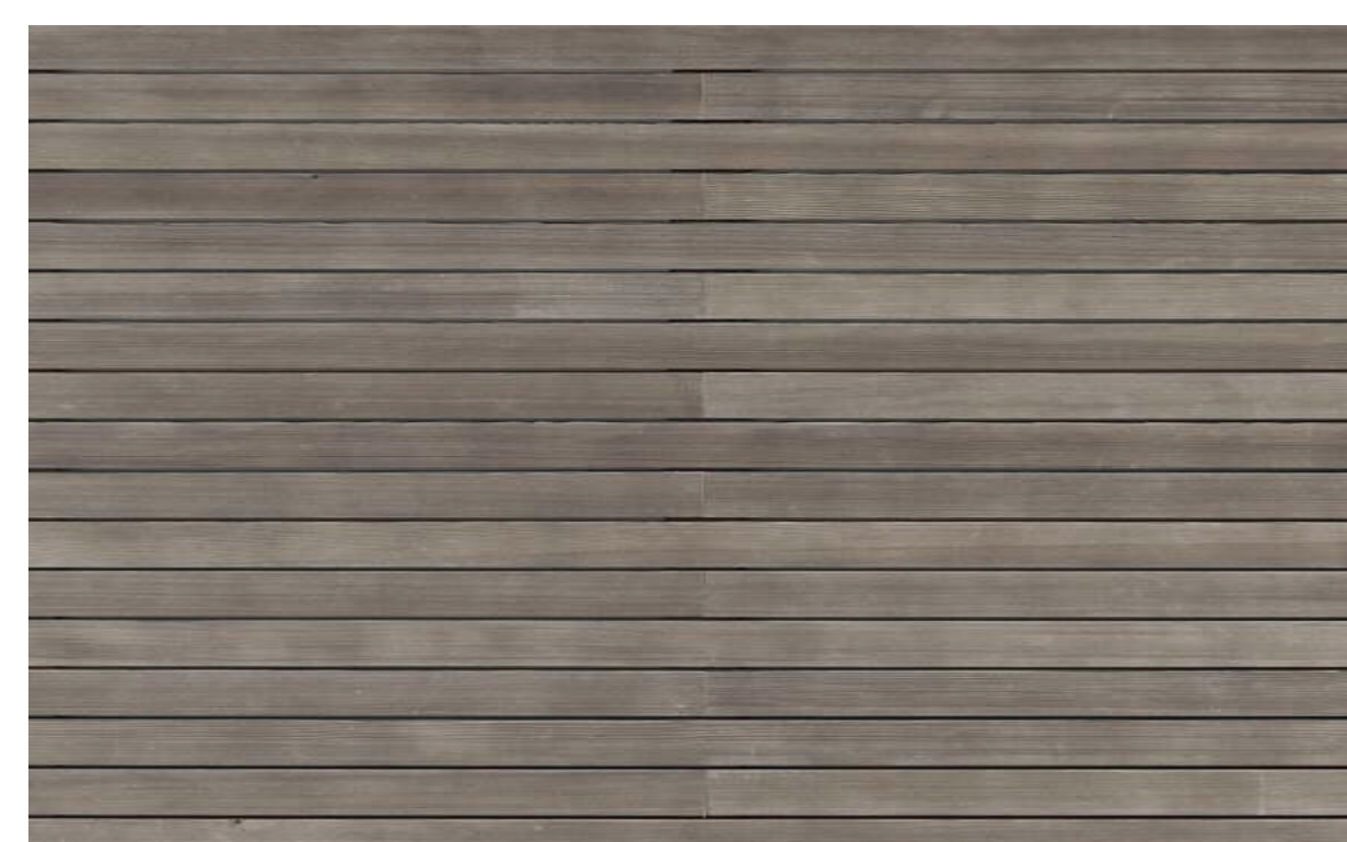
FC-2 - FIBER CEMENT PANEL- LIGHT