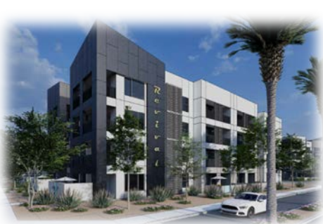
View from Dobson Road