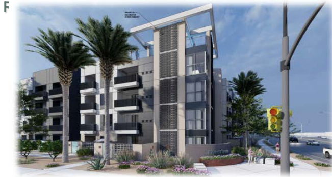
View from Cub's Way at Intersection