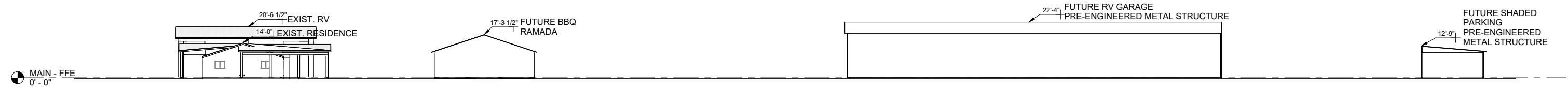
3 WEST ELEVATION 1" = 20'-0"