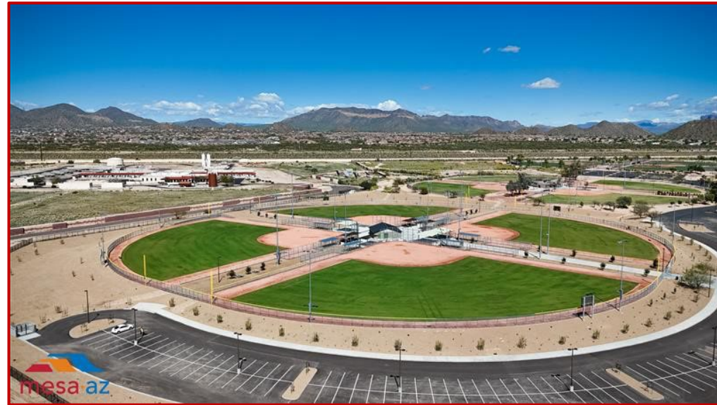
Red Mountain Park Expansion