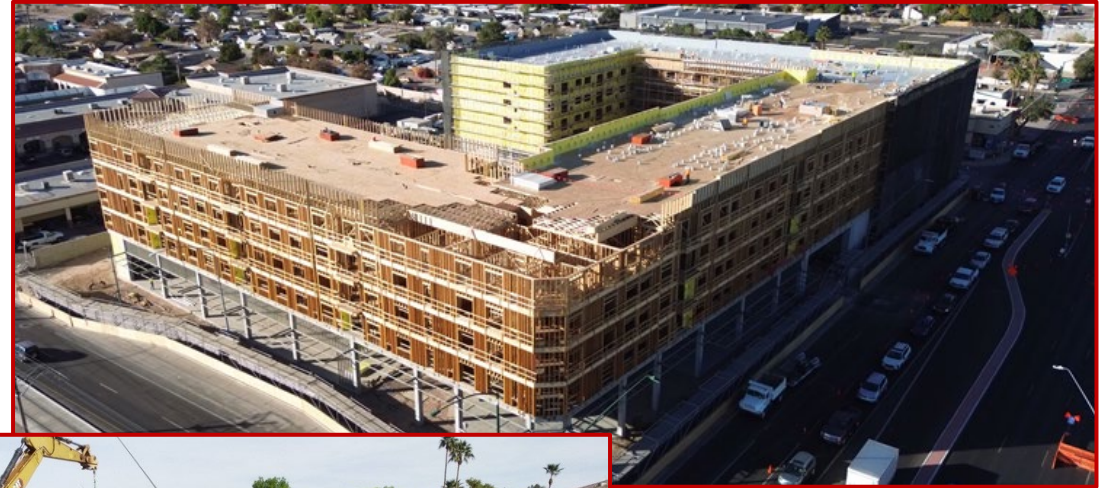
Residences on Main