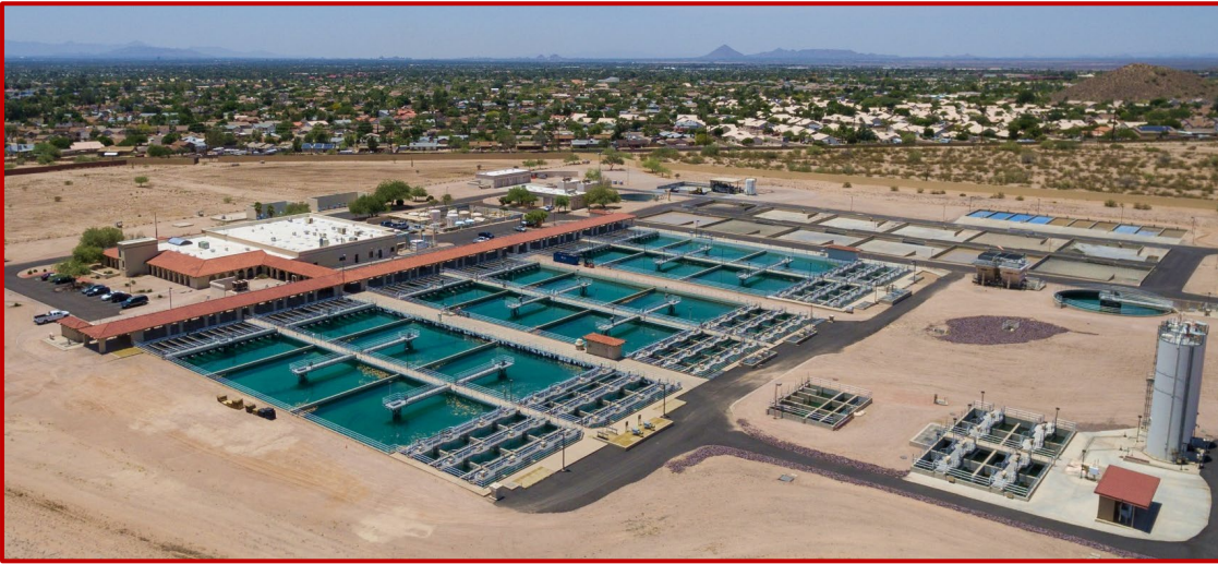
Brown Road Water Treatment Plant