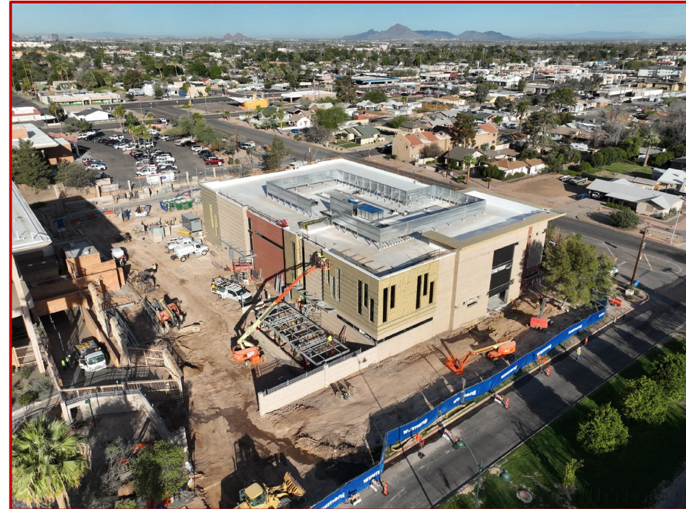
Police Department Evidence Facility