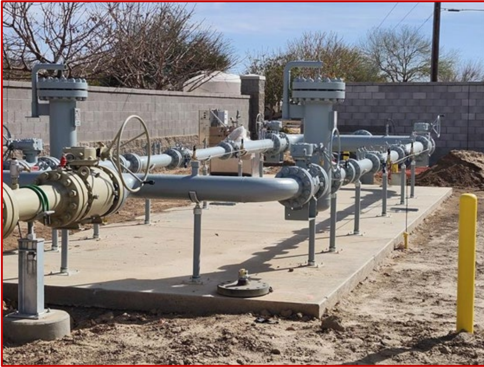
Queen Creek Gate Station