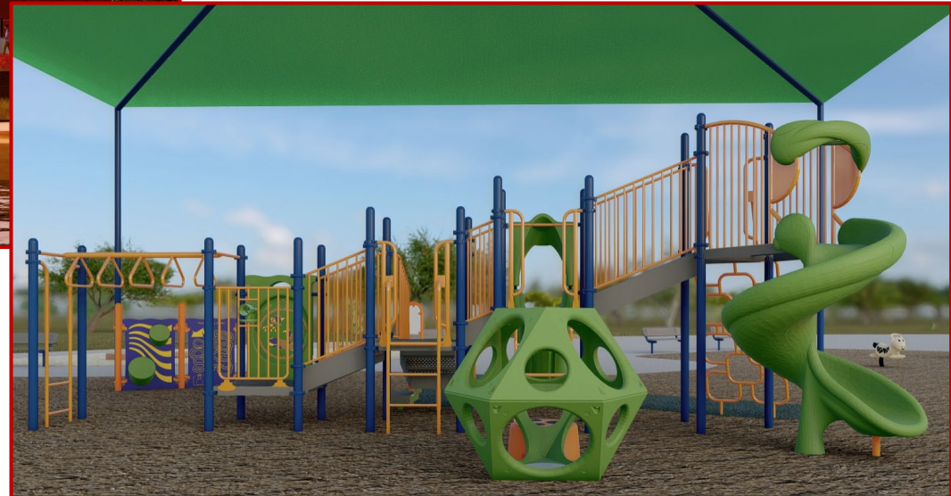
Reed Park Playground