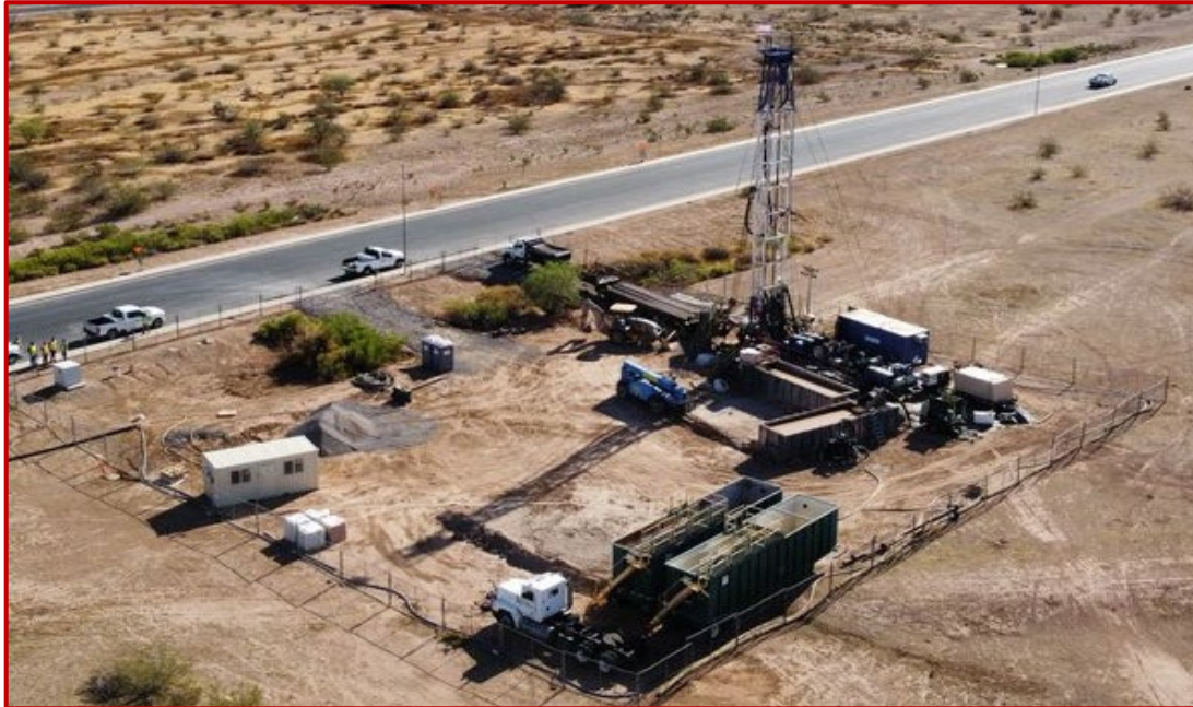
New Groundwater Well