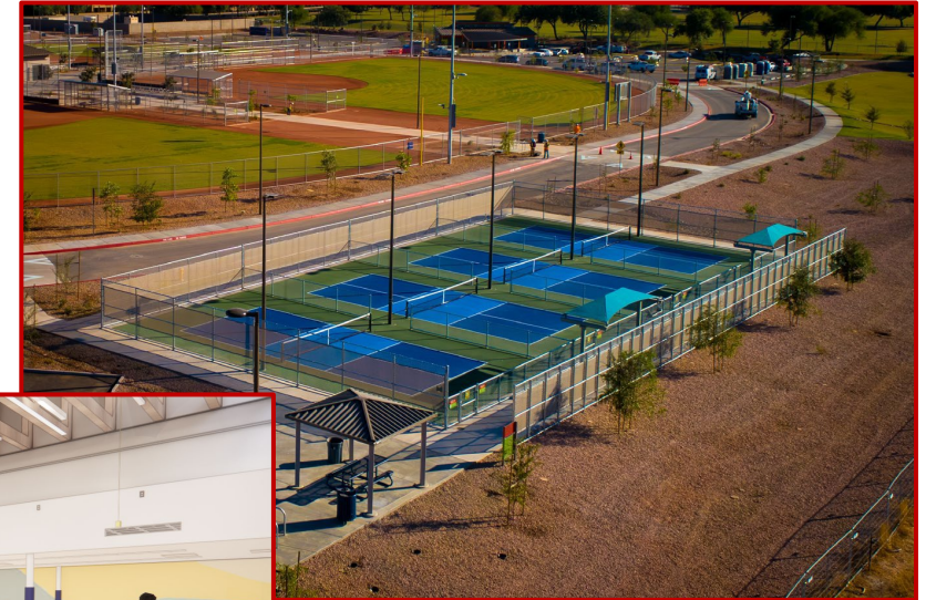
New Pickleball Courts