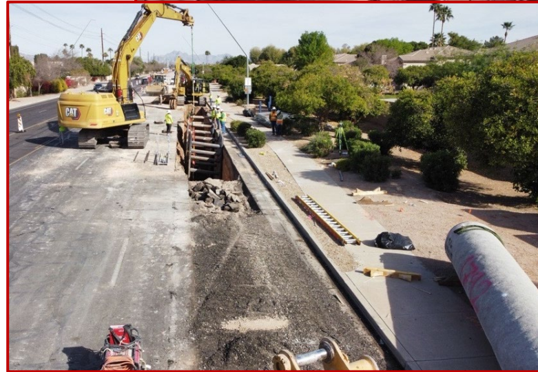
Central Mesa Reuse Pipeline