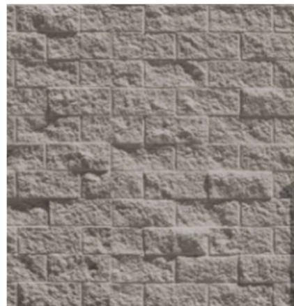
CONCRETE MASONRY UNITS TO MATCH MEDIUM GRAY PMS 401C