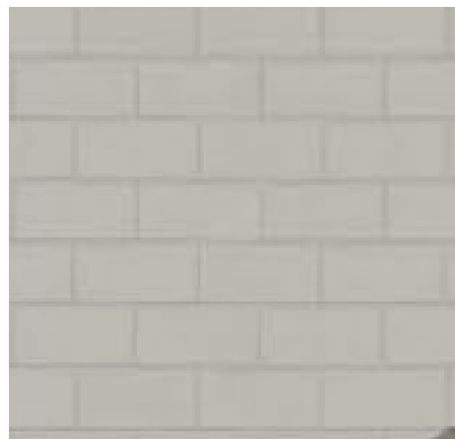
SMOOTH FACE CONCRETE MASONRY UNITS TO MATCH MEDIUM GRAY PMS 401C