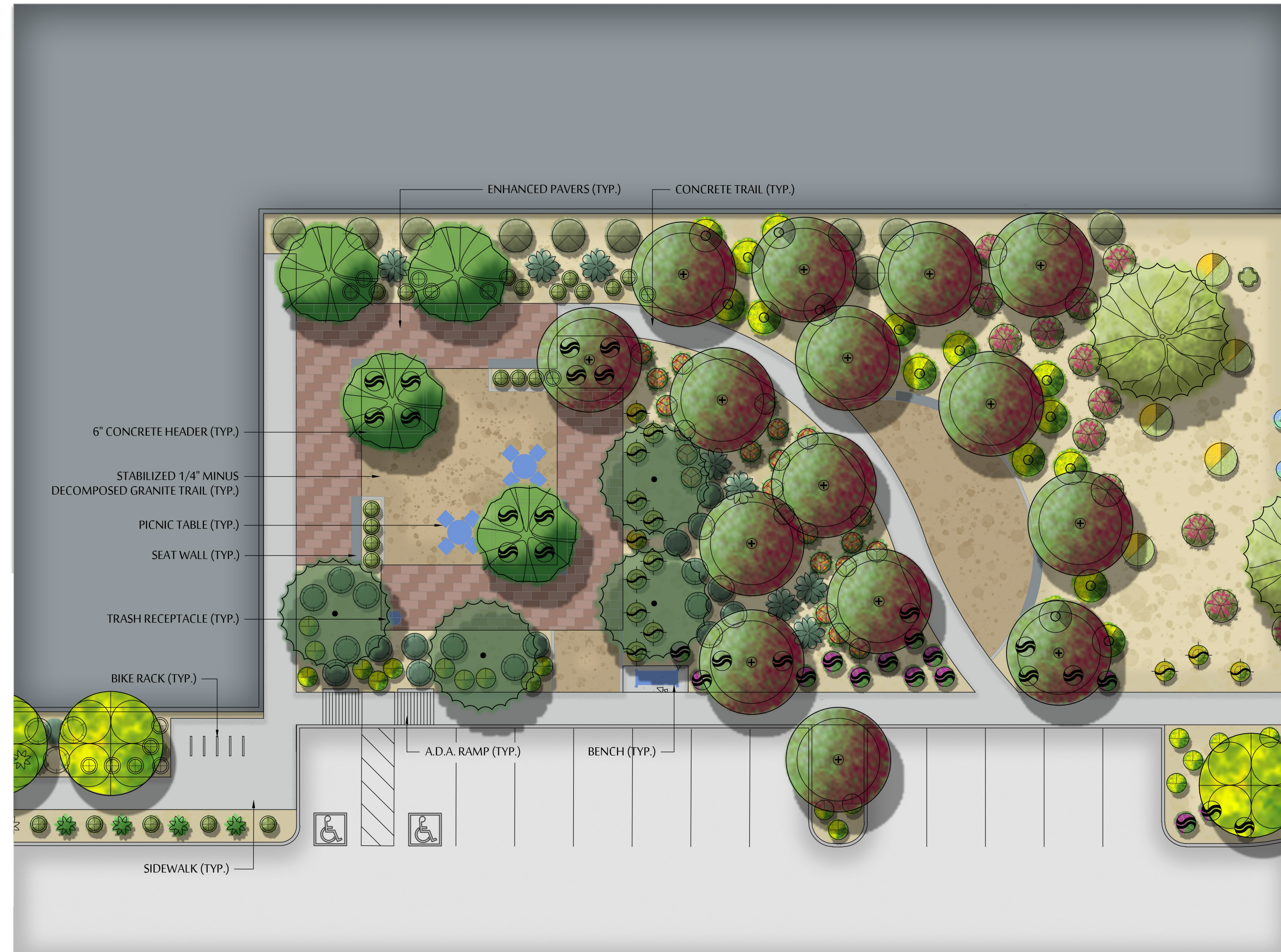
PLAZA AREA (TYP.)