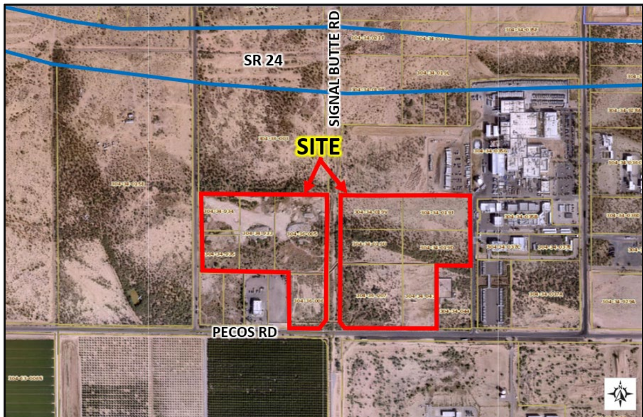
Figure 1 – Site Aerial

Gateway Auto Mall will bring about an exciting regional commercial auto and commercial use at a key arterial intersection, freeway interchange, and gateway into Mesa from other southeast valley cities. See the Site Aerial below.