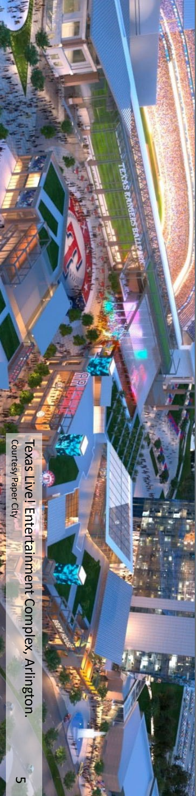
Texas Live! Entertainment Complex, Arlington.