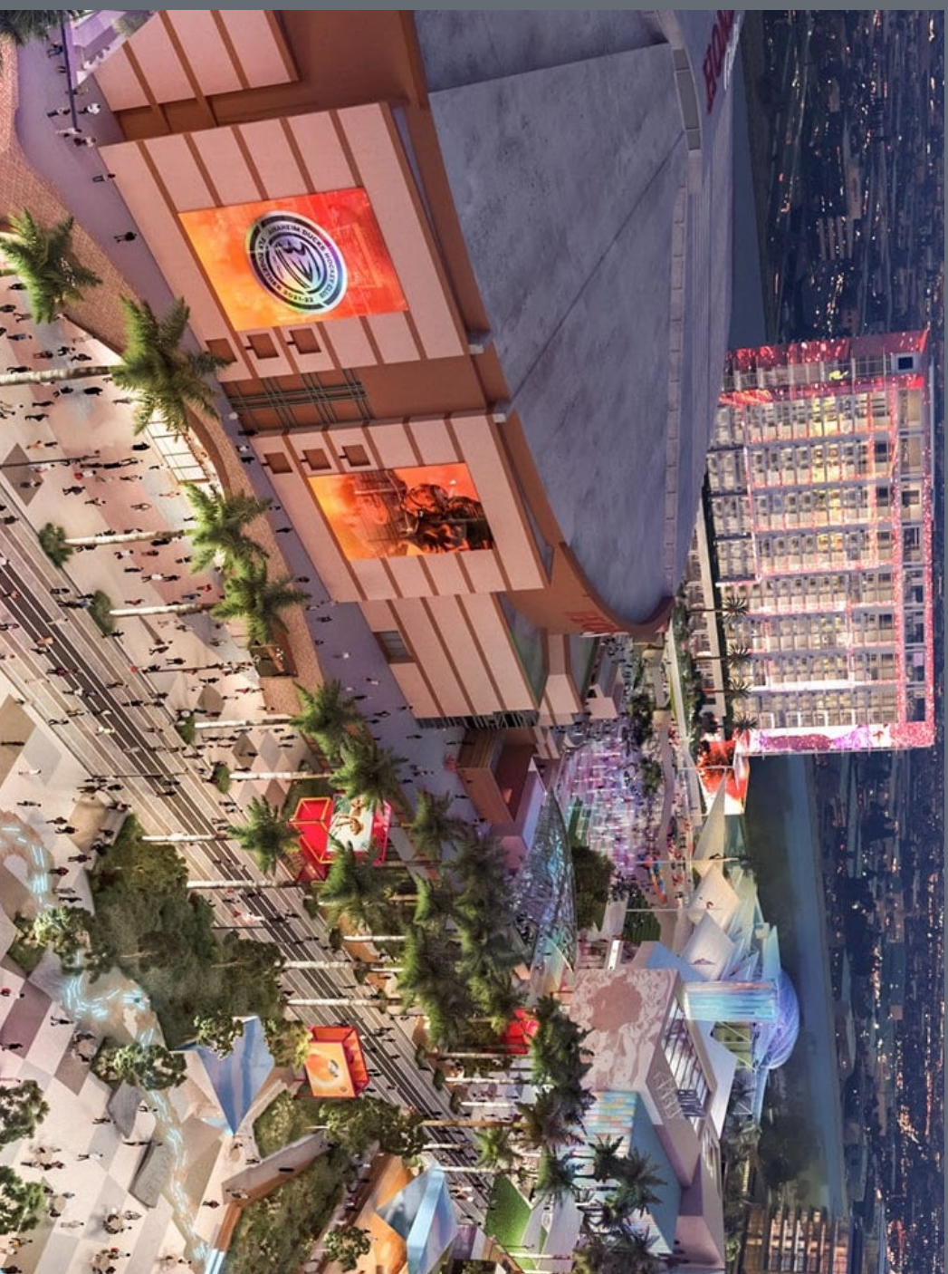
Proposed entertainment district. Honda Center, Anaheim California,

Courtesy Justin Byers, Front Office Sports, Sept 29, 2022