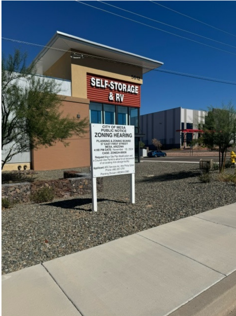
SIGN POSTING ZON24-00636 RED MOUNTAIN STORAGE