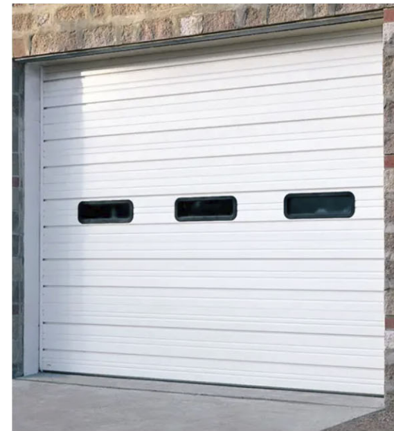
G. SECTIONAL OVERHEAD DOOR OVERHEAD DOOR CO. FACTORY FINISH "WHITE" TEMPERED VISION PANELS