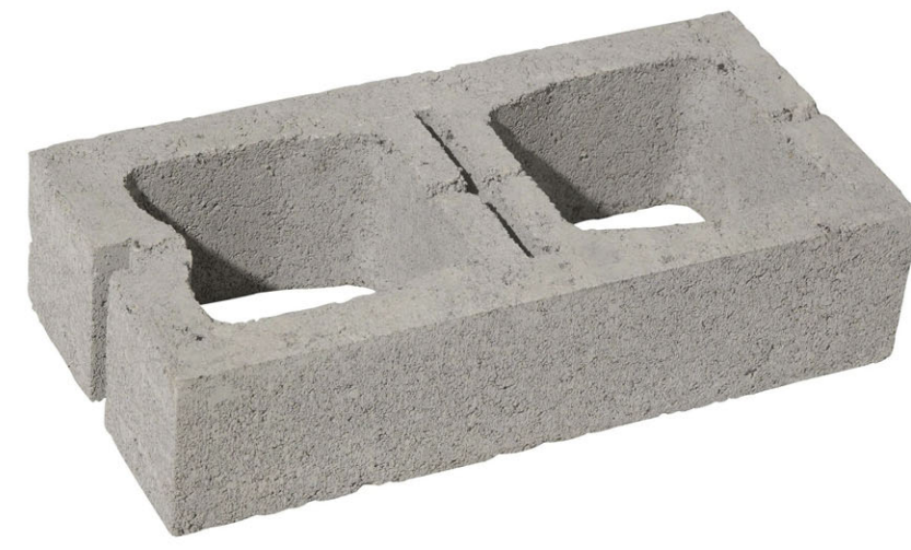
A. 8X4X16 MASONRY BLOCK NATURAL GREY FINISH