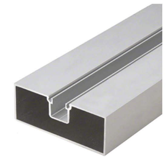
E. ALUMINUM STOREFRONT CLEAR ANODIZED ALUMINUM 1" INSULATED GLAZING U=0.4 SHGC =0.25