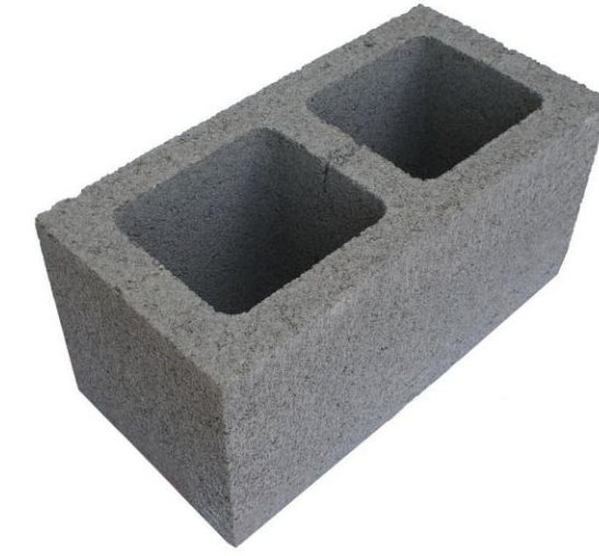
C. 8X8X16 MASONRY BLOCK FENCE WALL, NATURAL GREY FINISH