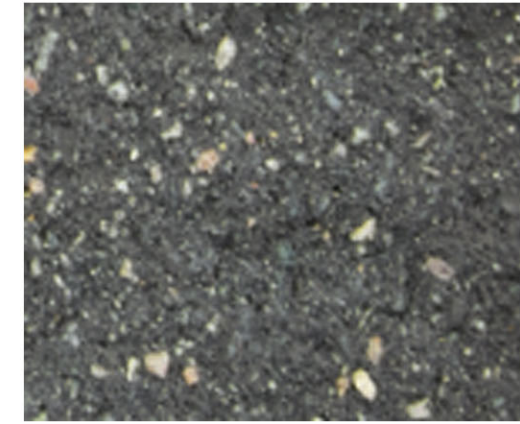
B. 8X8X16 MASONRY BLOCK ECHELON MASONRY 4106 "BLACK" SPLIT FACE FINISH