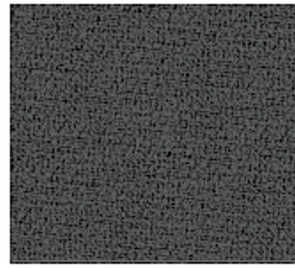
FRAMED ARCHITECTURAL BUILDOUT SCORED STUCCO-SMOOTH FINISH DE 6354-GRAY WOLF