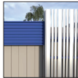
METAL PANELS PAINTED CENTURY BLUE METAL STUD SCREEN WALLS GALVANIZED FINISH