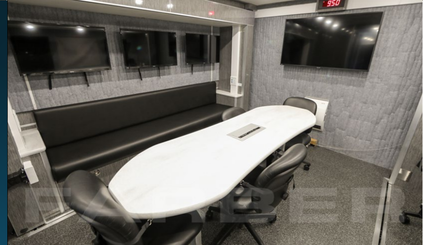
Proposed New Command Trailer