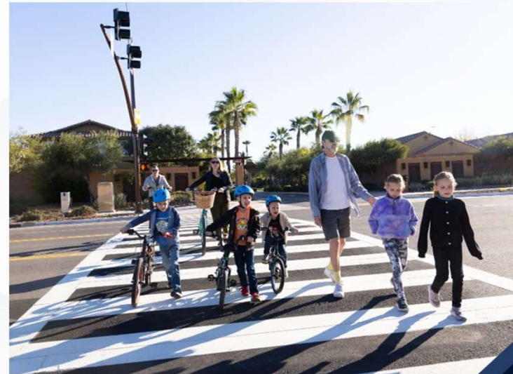
Gateway Library Pedestrian Hybrid Beacon