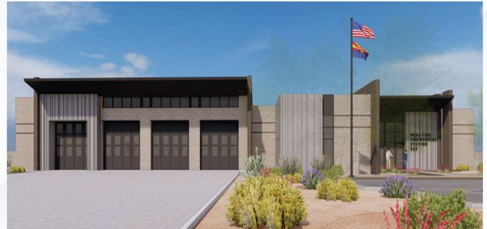
Fire Station 223