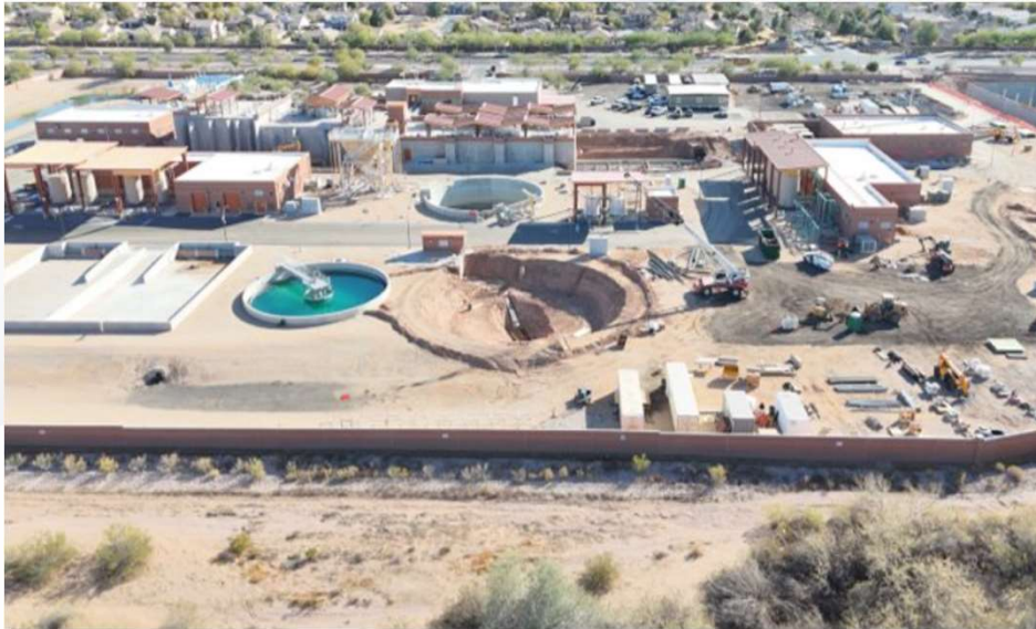
Signal Butte Water Treatment Plant