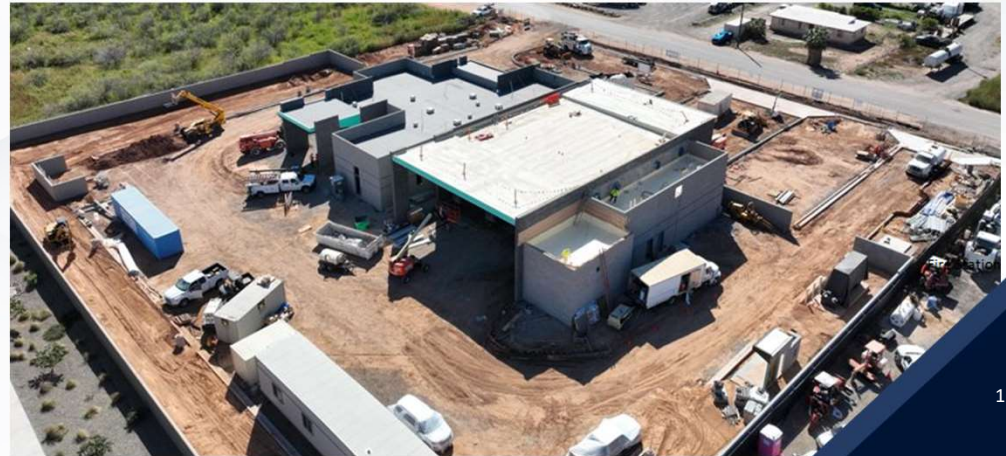
Fire Station 224