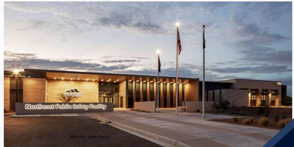
NE Public Safety Facility