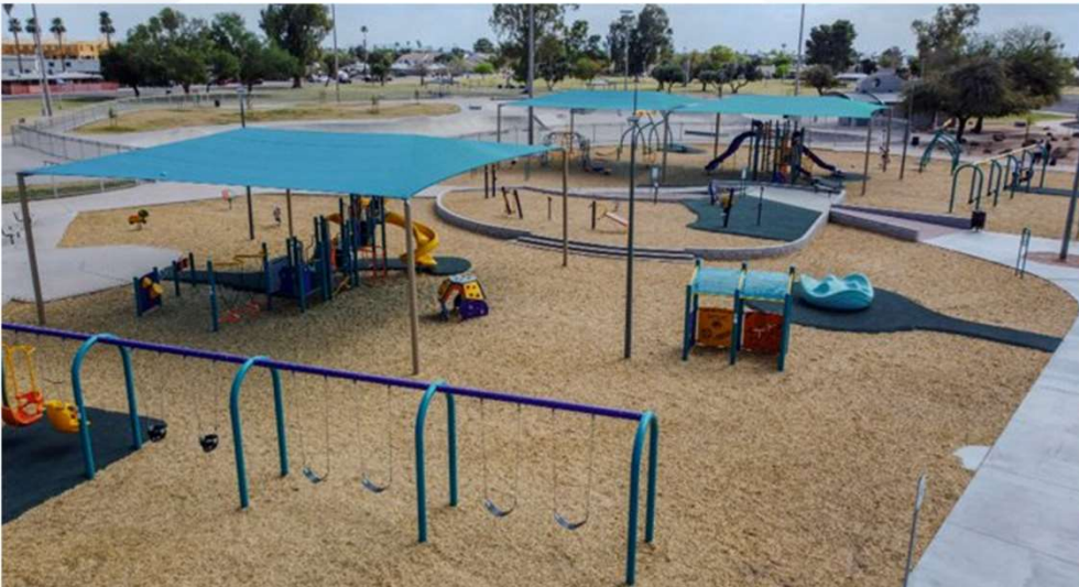
Reed Park Playground