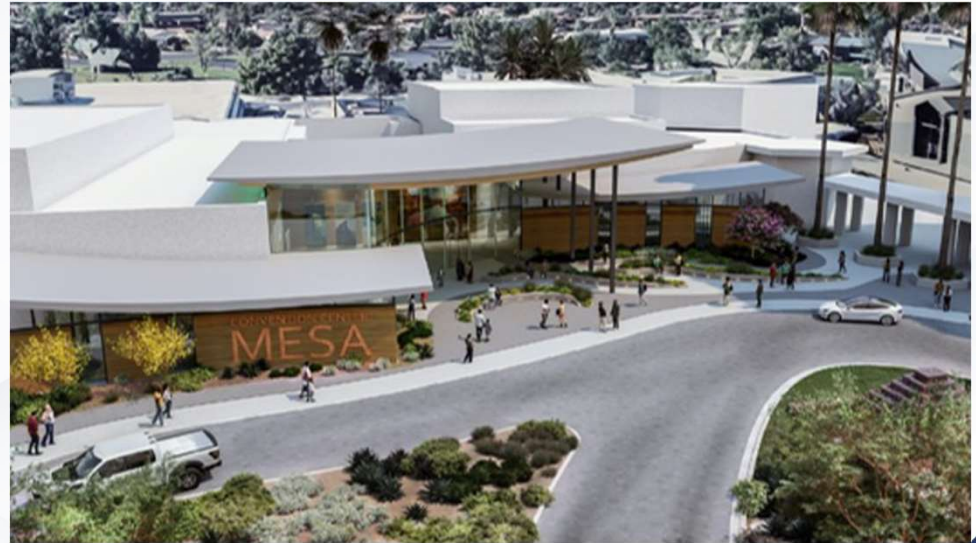
Convention Center Lobby (concept)