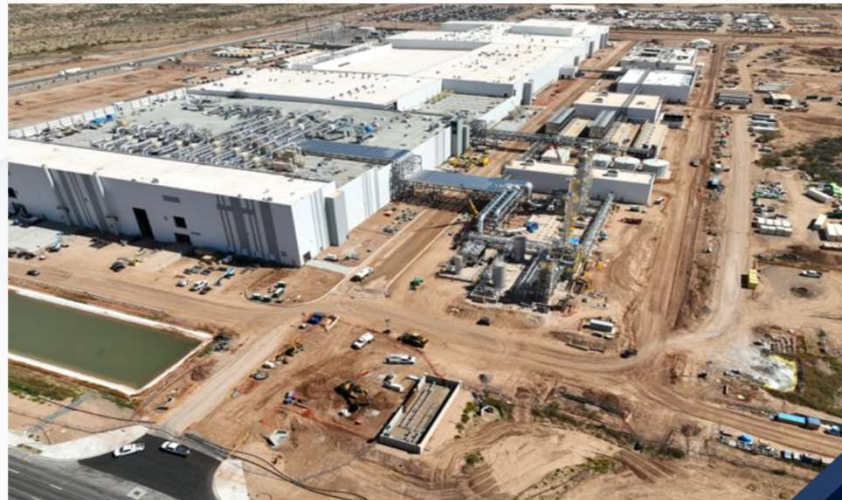
LG Gas Line