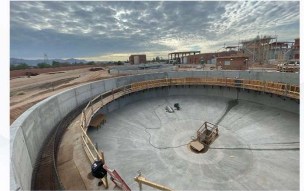
Signal Butte Water Treatment Plant