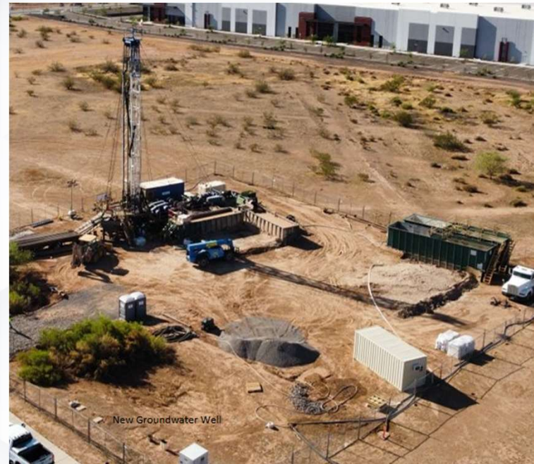
New Groundwater Well