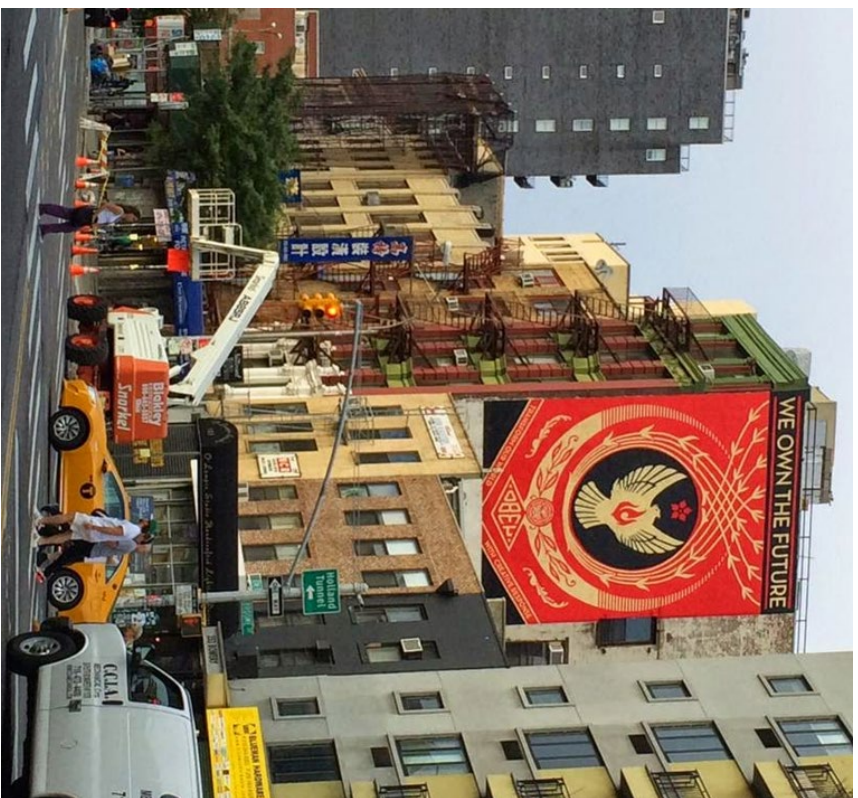
We Own the Future, 2014 Little Italy, New York, NY