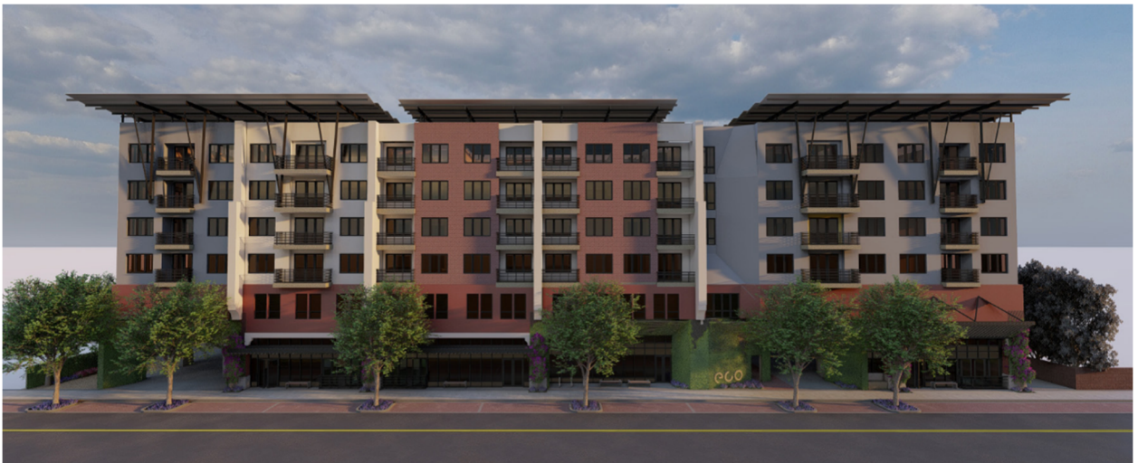
Guideline building mass depth above 2 nd floor is not perceptible from street.

The requirement and need to maintain the existing 76 parking spaces of the Purple Lot for public use deprives the property of uses or development options available to other properties in the same zoning due to its inherent location and necessity for its existing use to be maintained.