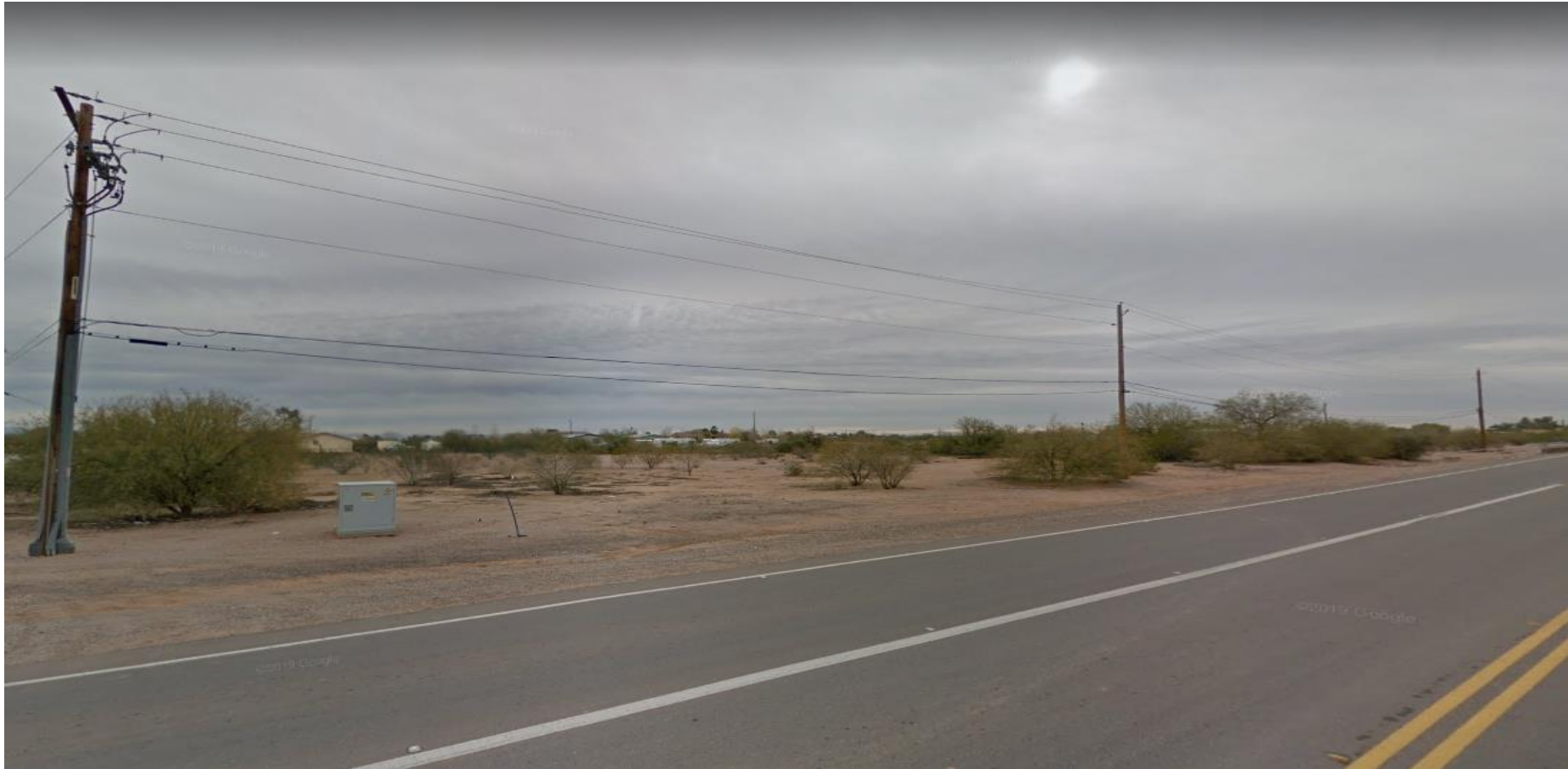
Mountain Road looking east