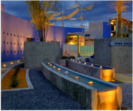
Arts and Culture