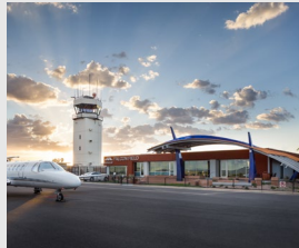
Falcon Field Airport