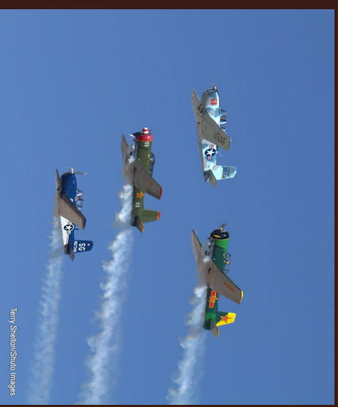
Terry Shelton/Studio Images