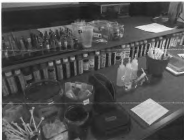
Figure 1. Photo of juice bar mixing station.

The shop employees and manager reported that the flavoring chemicals make up approximately 20% of the e-liquid. The remaining 80% is propylene glycol, vegetable glycerin, and nicotine. The vegetable glycerin to propylene glycol ratio can be specified by the customer, and it was reported that customers typically use more vegetable glycerin than propylene glycol. The amount of nicotine added was based upon the amount a customer requested. If customers did not know how much nicotine they wanted, the employees discussed the customer's previous cigarette or cigar smoking history and made a recommendation based upon how much they typically smoked. The shop's stock nicotine solution is 100 milligrams per milliliter. The stock solution is diluted to shop-defined concentrations that correspond to smoking from one half of a pack up to 2.5 packs of tobacco cigarettes. This nicotine level can be adjusted according to customers' preferences.