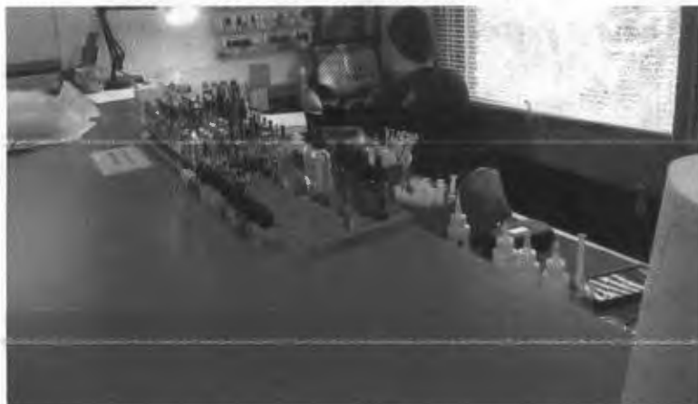
Figure 4. Assortment of e-liquid tanks and e-cigarettes customers used to sample different flavors at the juice bar.

at the juice bar, but this practice was infrequent. When customers did sample flavors, they stood directly across from employees working at the juice bar. Customers could use the company's e-cigarette and tank along with a disposable safety tip to try different e-liquid flavors (Figure 4). The disposable safety tip was not reused between customers. The employer reported that each night employees cleaned the individual e-cigarettes with Lysol® wipes, as customers sometimes neglected to use the safety tips.