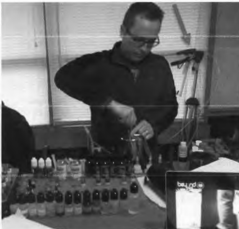
Figure 2. A National Institute for Occupational Safety and Health (NIOSH) investigator preparing to collect an air sample. An area sampling station is next to the window behind juice bar.