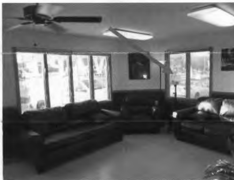
Figure 3. Area sampling basket in the front lounge area.