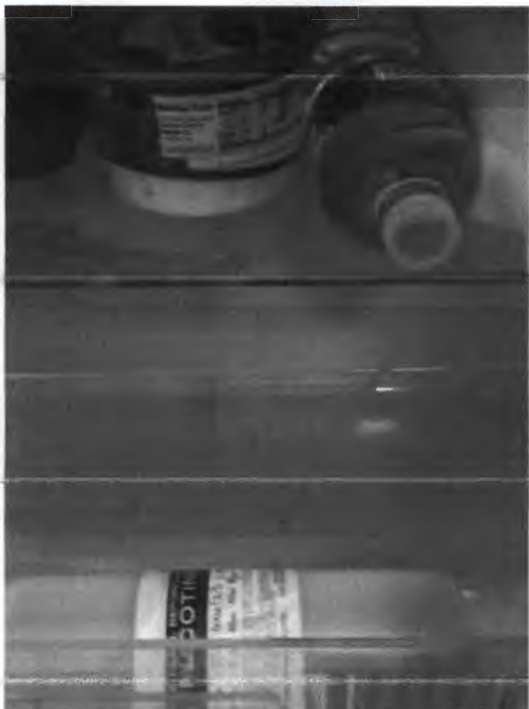
Figure 5. Stock nicotine solution stored in the bottom of a refrigerator that was also used to store food.