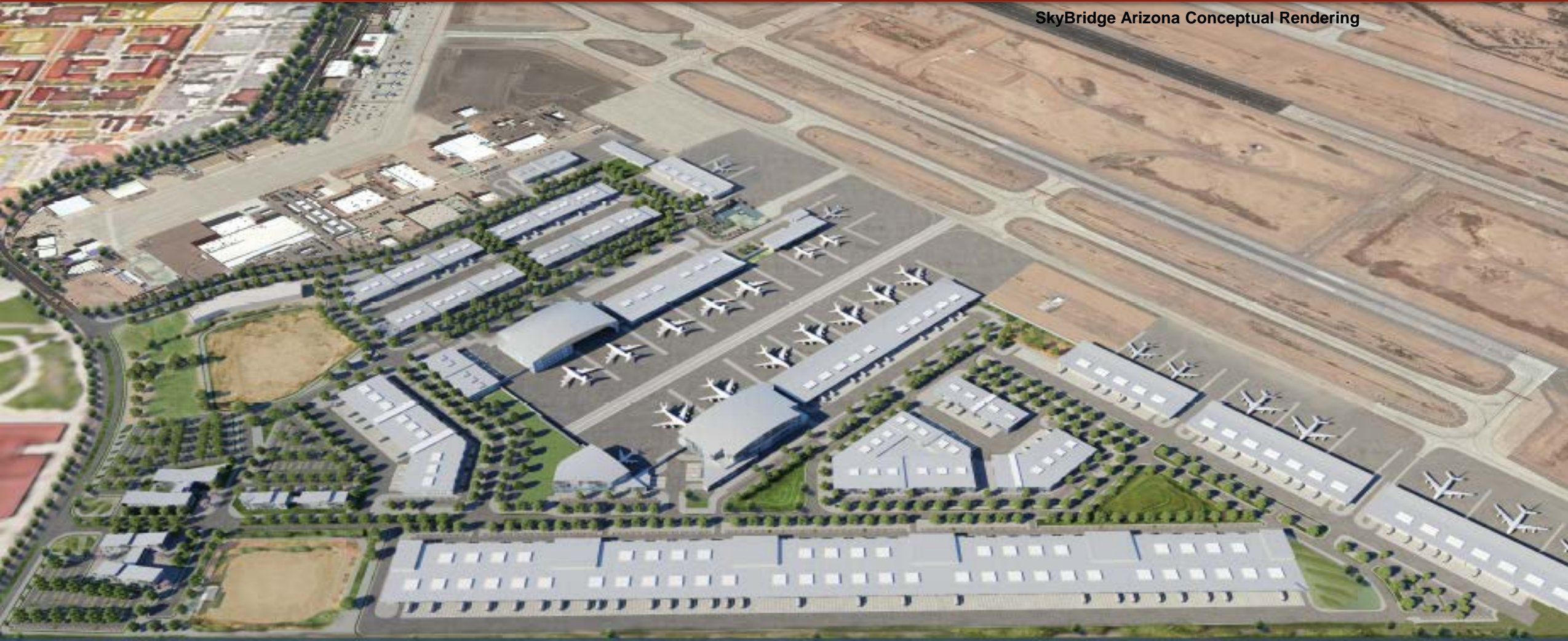
SkyBridge Arizona Conceptual Rendering