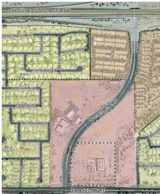
Zoning map of the area

The property is currently zoned Limited Commercial (LC). The proposed land use is allowed within the LC zoning district with a Special Use Permit (SUP).