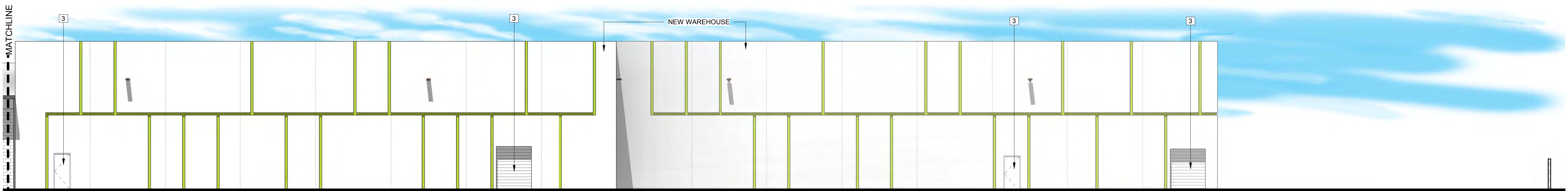
② EAST B COLOR 1" = 10'-0"