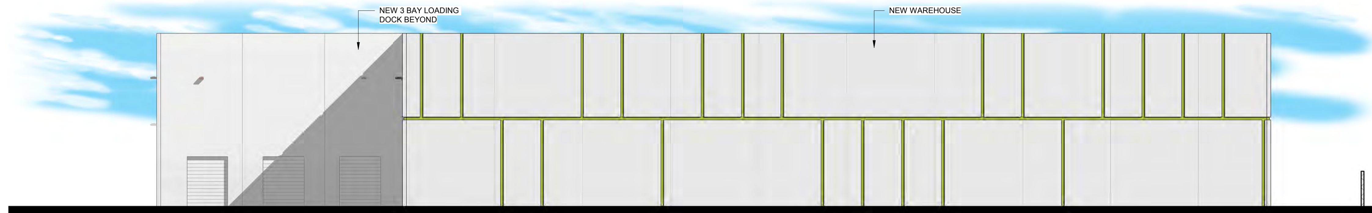
⑤ NORTH COLOR 1" = 10'-0"