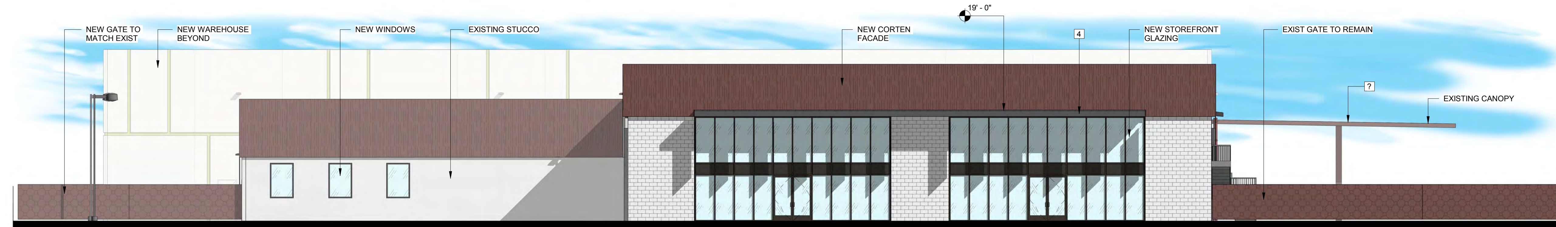
⑥ SOUTH COLOR 1" = 10'-0"