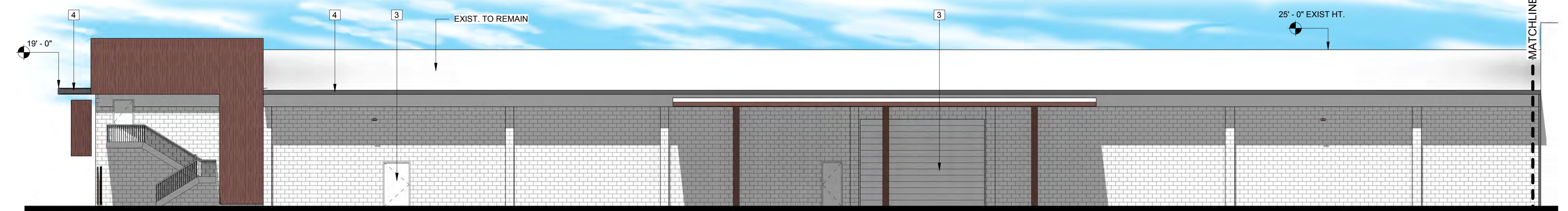
① East A COLOR 1" = 10'-0"