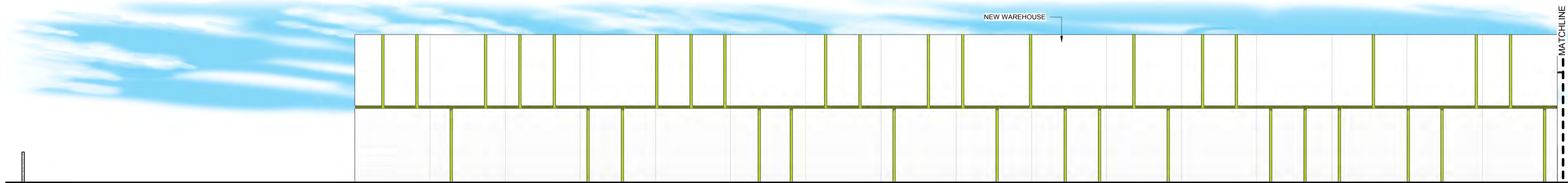
③ WEST A COLOR 1" = 10'-0"