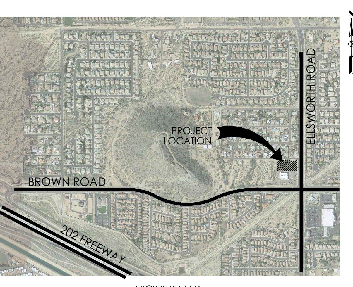
VICINITY MAP N.T.S.