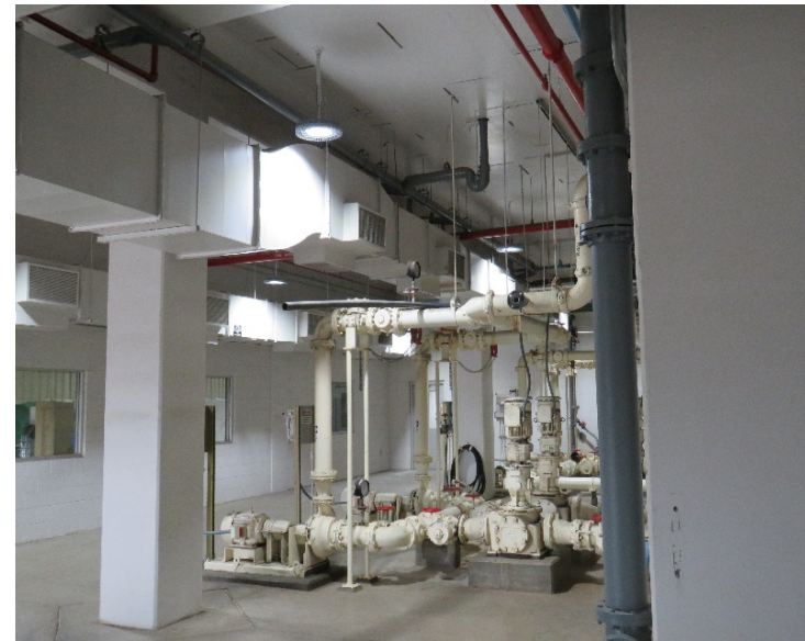
Lighting levels after LED conversion