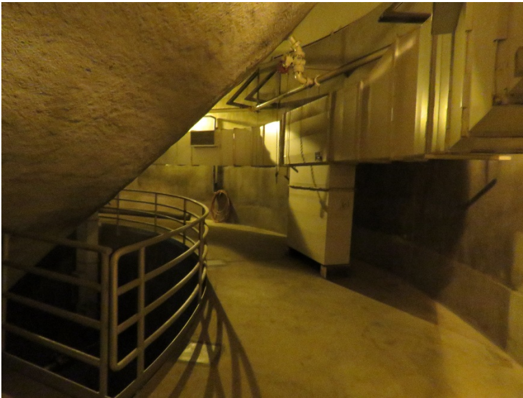
Lighting levels before LED conversion

➤ $369,900 savings in 2016 (4,623,099kWh)