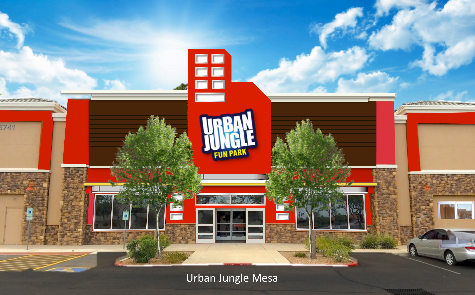
Urban Jungle Mesa