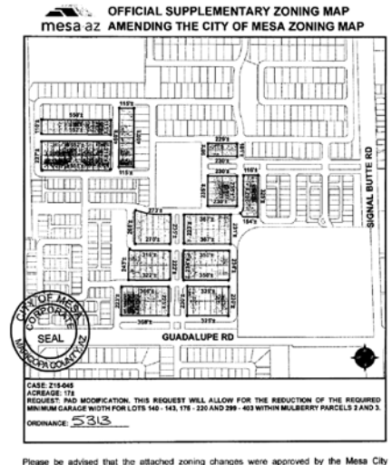
TEST: Oulun Wickelsen

GARAGE WIDTH: Two of the house models in the Americana Collection (used in Parcel 3, and proposed for Parcel 5) have garage widths of 19'-4", which is 8" less than the 20' width required by Mesa's current Zoning Ordinance. The case for this deviation was made and approved in February of this year (Z15-045) and the applicant was granted a PAD modification to allow the deviation, limited to the undeveloped lots within Parcel 3. (See the Ordinance map, right, for the specific lots.) The current request extends the approval to Parcel 5 only. As in Parcel 3 the approval applies just to the two house models identified in the original request. The 8" width was transferred from the garage to the entry area of the house, in response to comments from buyers.