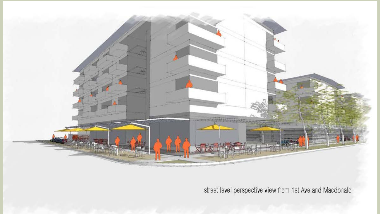
street level perspective view from 1st Ave and Macdonald