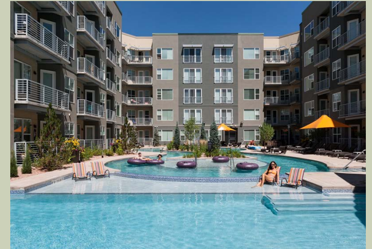
Representative Projects from Design Partner