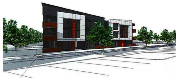
VIEW LOOKING SOUTHWEST