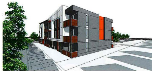
VIEW LOOKING SOUTHEAST