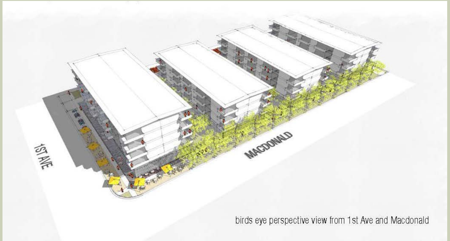
birds eye perspective view from 1st Ave and Macdonald