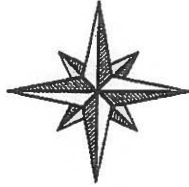
EXHIBIT "A" SEVILLE AT MOUNTAIN BRIDGE PUBLIC DRAINAGE EASEMENT ABANDONMENT 04/20/2016 WP# 134113.07 PAGE 2 OF 2 NOT TO SCALE

R:\Mountain Bridge\2013\134113\Survey\Legal\4113-L09.DWG