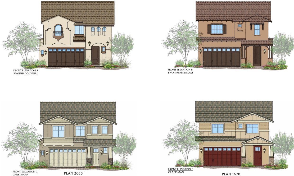
Fig. 2.0 Elevations