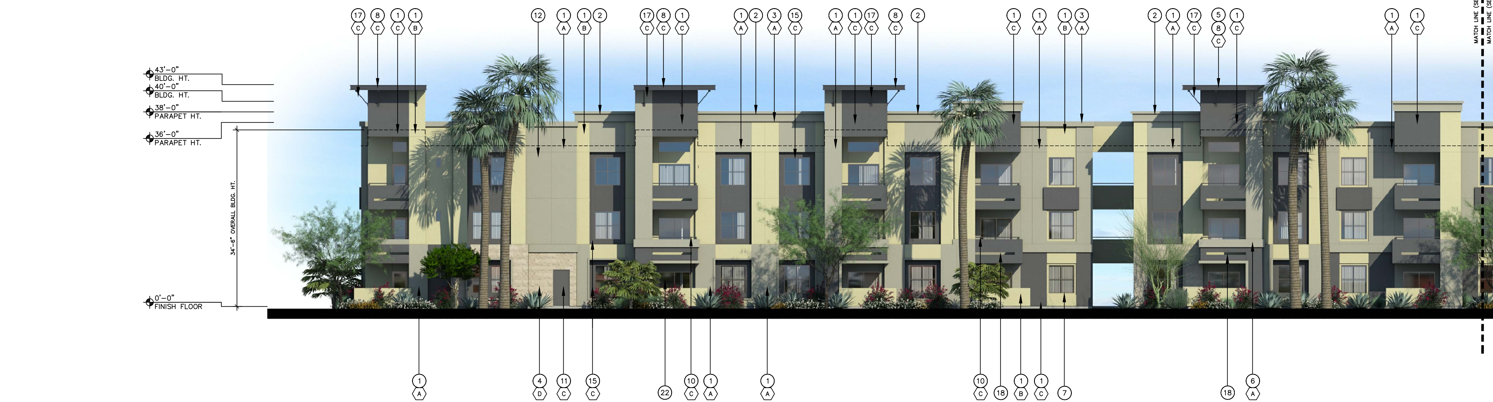
(A) FRONT ELEVATION (SEGMENT 1)