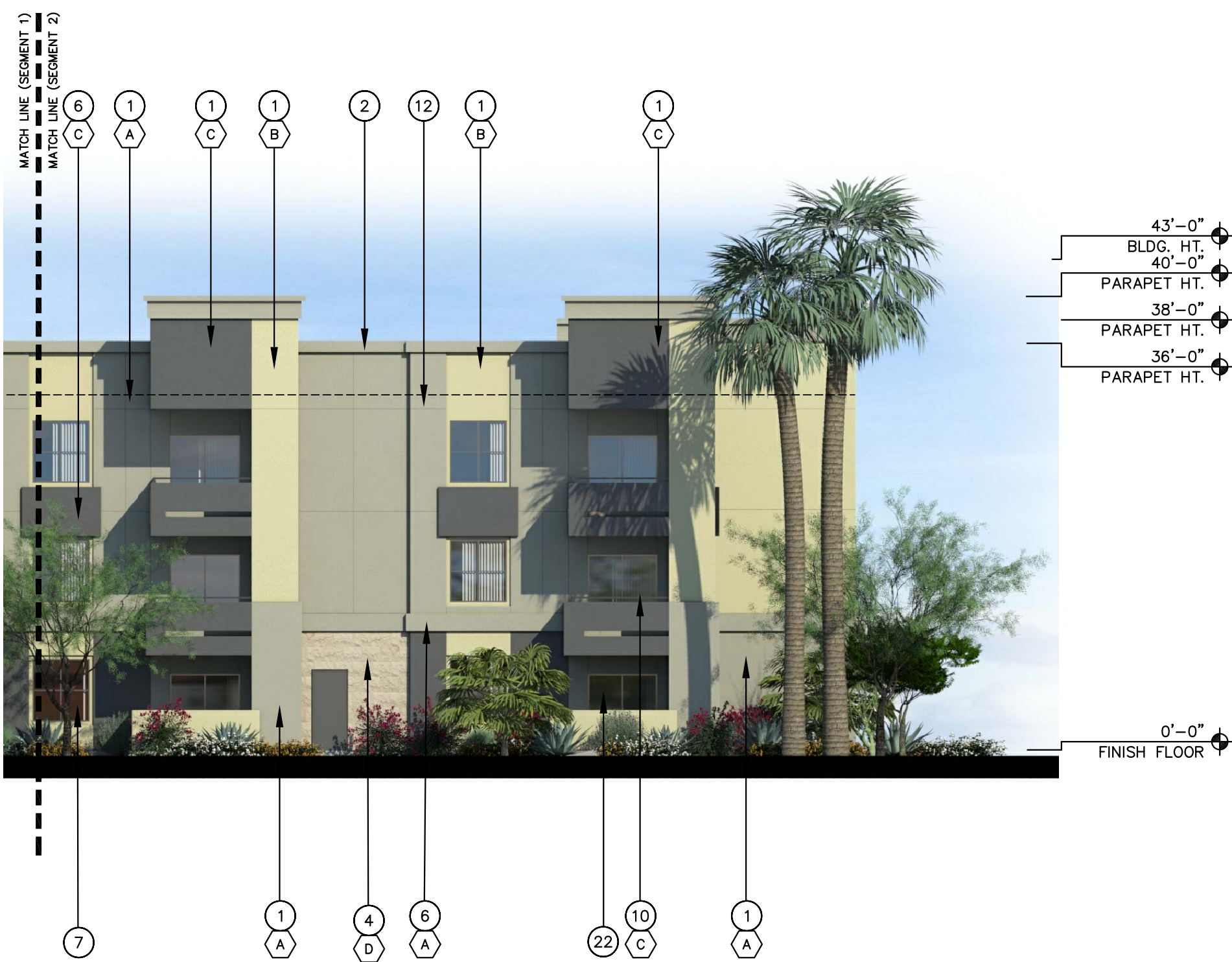
(B) FRONT ELEVATION (SEGMENT 2)