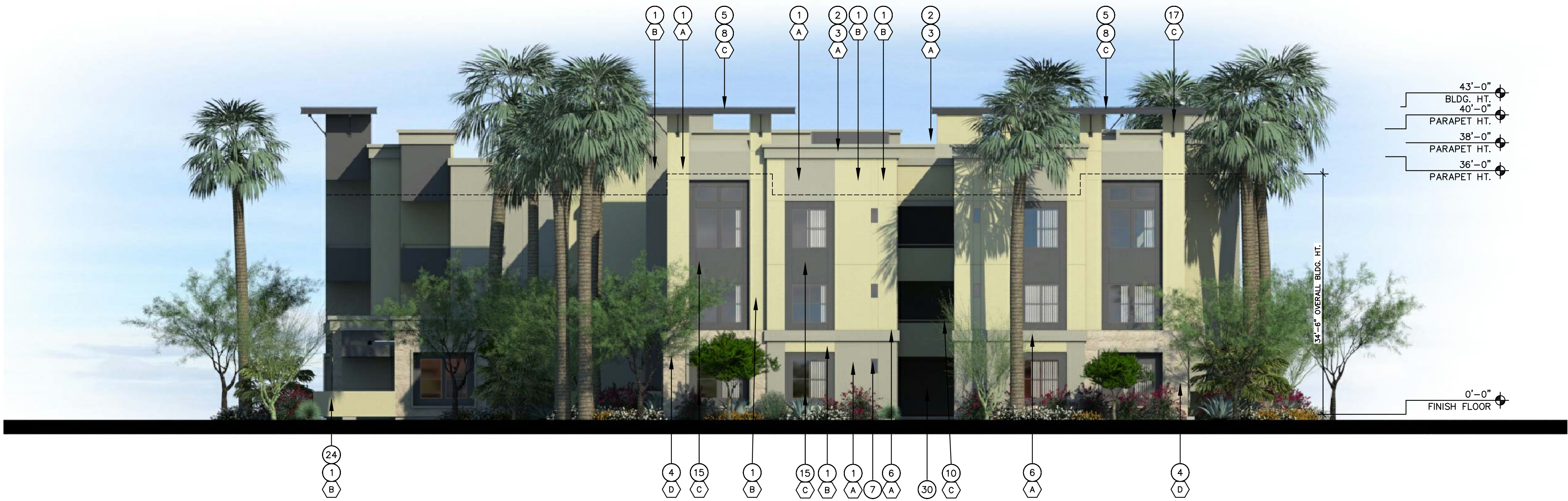
E RIGHT ELEVATION