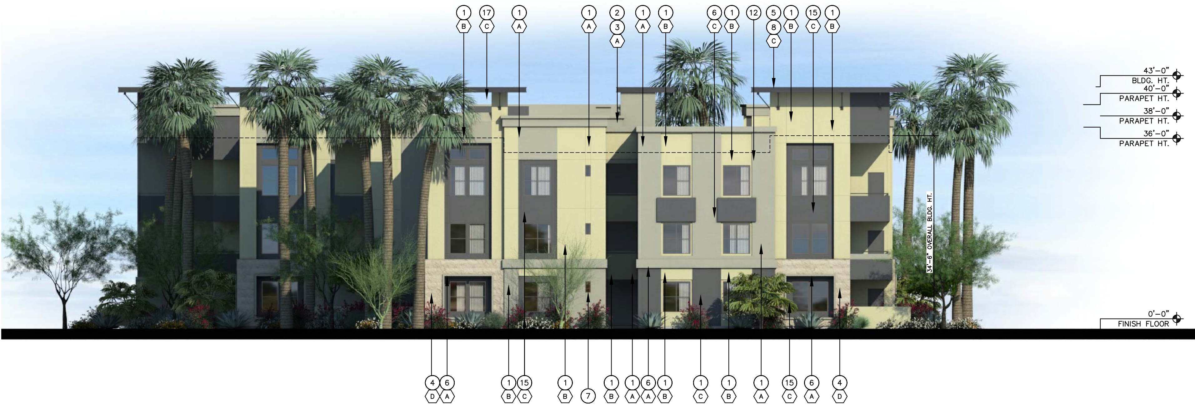
F LEFT ELEVATION