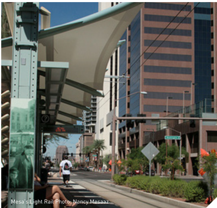
Mesa's Light Rail