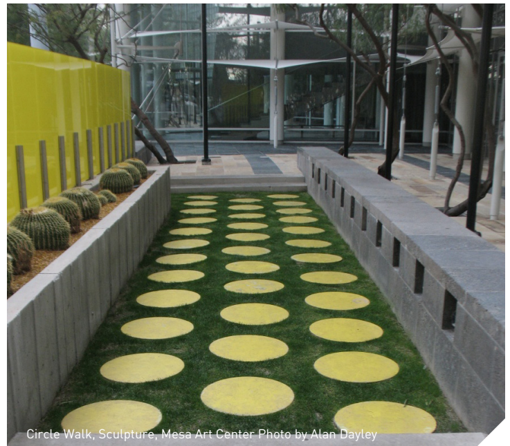
Circle Walk, Sculpture, Mesa Art Center