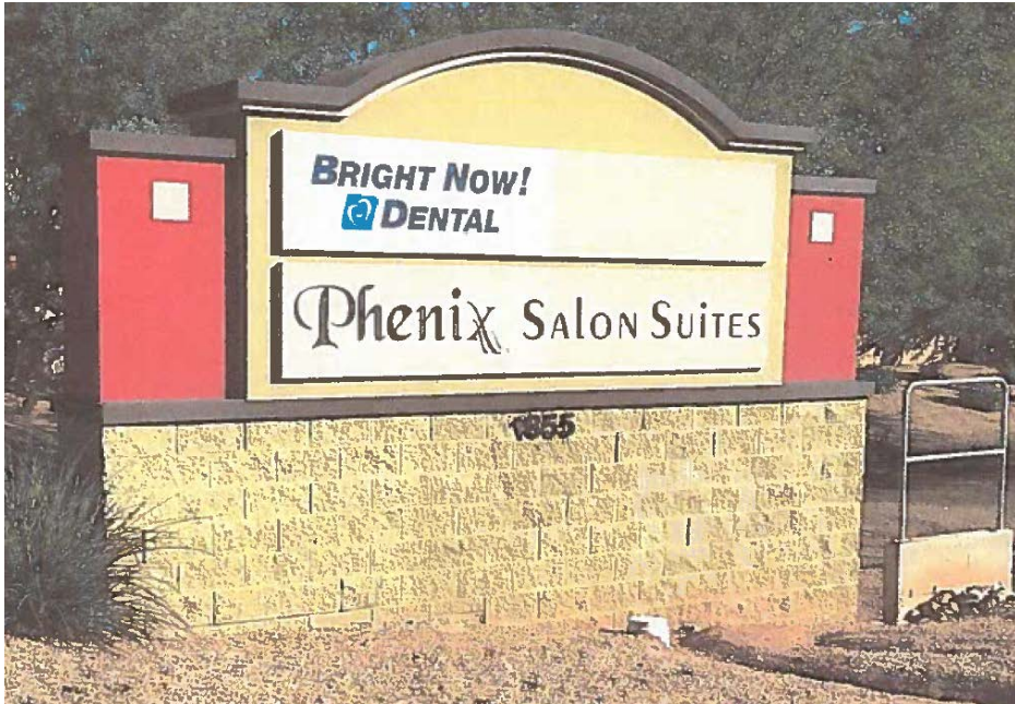
Existing Building B detached sign to be relocated TM-1