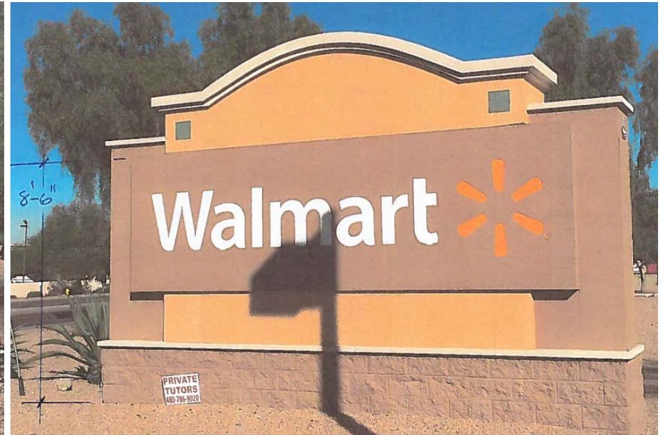
Existing 12' high over height at Country Club Drive WM-1