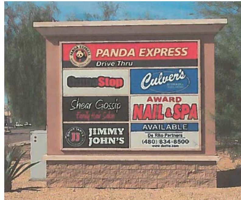
Existing 12' high overall height at Road approved ZA09-009