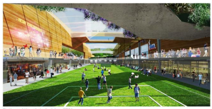
Flexible sports field in artificial turf mode for an AYSO League game.