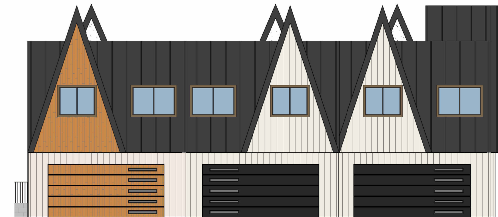
① ELEVATION GARAGE 1/8" = 1'-0"