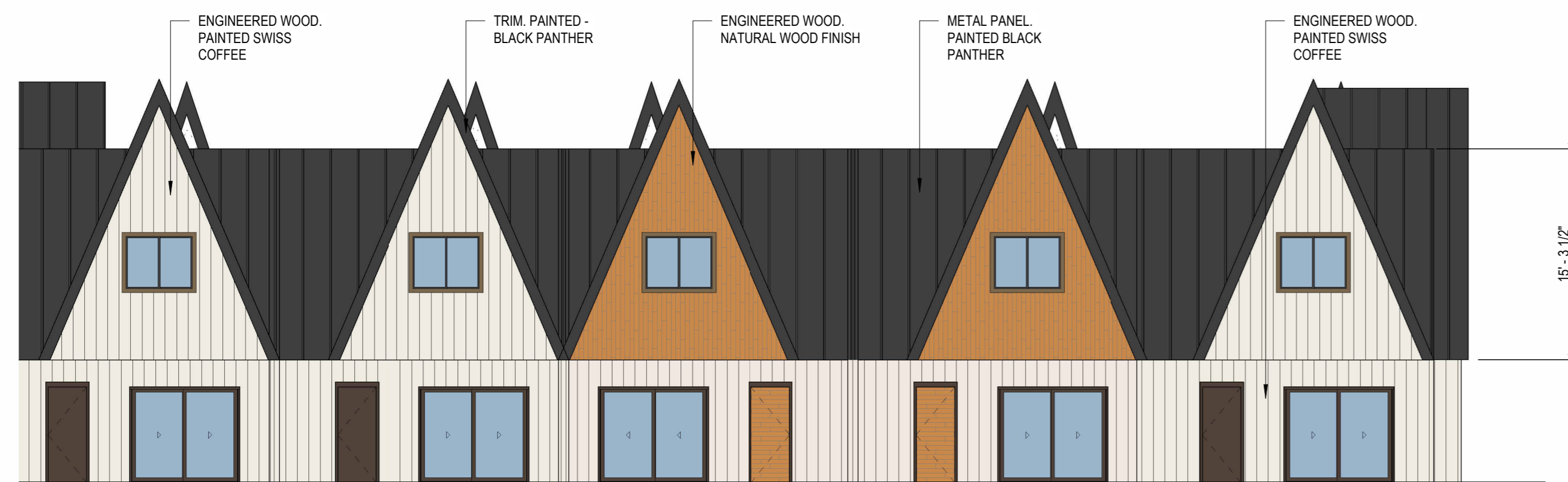
② ELEVATION FRONT 1/8" = 1'-0"