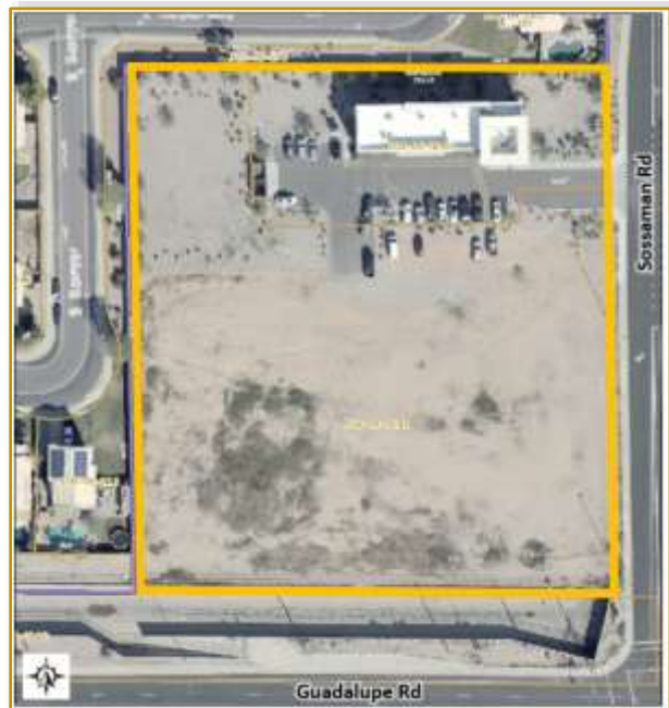
Figure 7 – NWC of Sossaman & Guadalupe Roads

Taking broader view of commercially-zoned parcels in the area, there are LC zoned parcels in each direction at every 1-mile interval: two on Guadalupe Road at Power and Hawes Roads, and two on Sossaman Road at Elliot and Baseline Roads. These are among other commercial and employment zoned properties, most of which are undeveloped or are below capacity. The greatest impact seems to come from the fact that the Superstition Springs regional commercial center is only one/two miles to the north starting at the south corners of Power Road and Baseline Roads. Given the number of households and large single-family developments in this area and adequate commercial property in the vicinity, a residential use is more appropriate for the subject property.