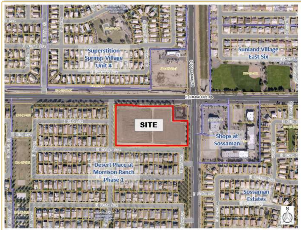
Figure 1 – Site Aerial