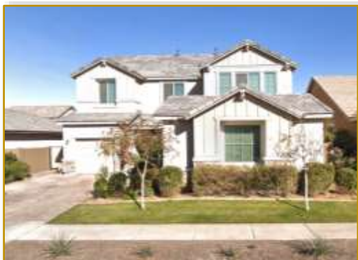
Figure 11 – Representative Imagery of Nearby Morrison Ranch Housing

The photos below of homes in Morrison Ranch are not submitted for design proposals, but which are presented here to indicate of the level of quality design that will be provided in this proposed development. Actual building plans will be different, but they will consistent with the below images and other housing types offered in the surrounding community.