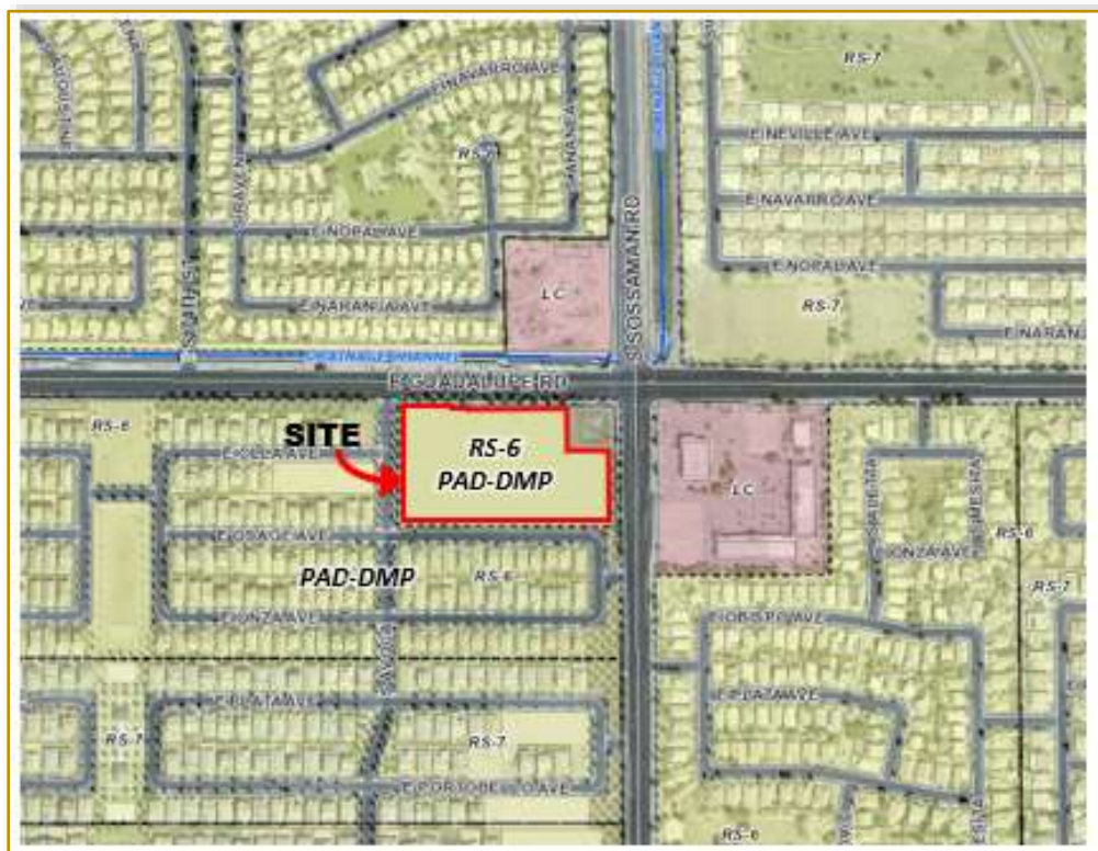
Figure 2 – Proposed City of Mesa Zoning

It is noted that the proposed subdivision will be contiguous to the Morrison Ranch Subdivision, and as such, this will constitute a modification of the same final plat recorded as MCR 1131-34 on December 5, 2012. The below Figure 2 illustrates the proposed zoning request: