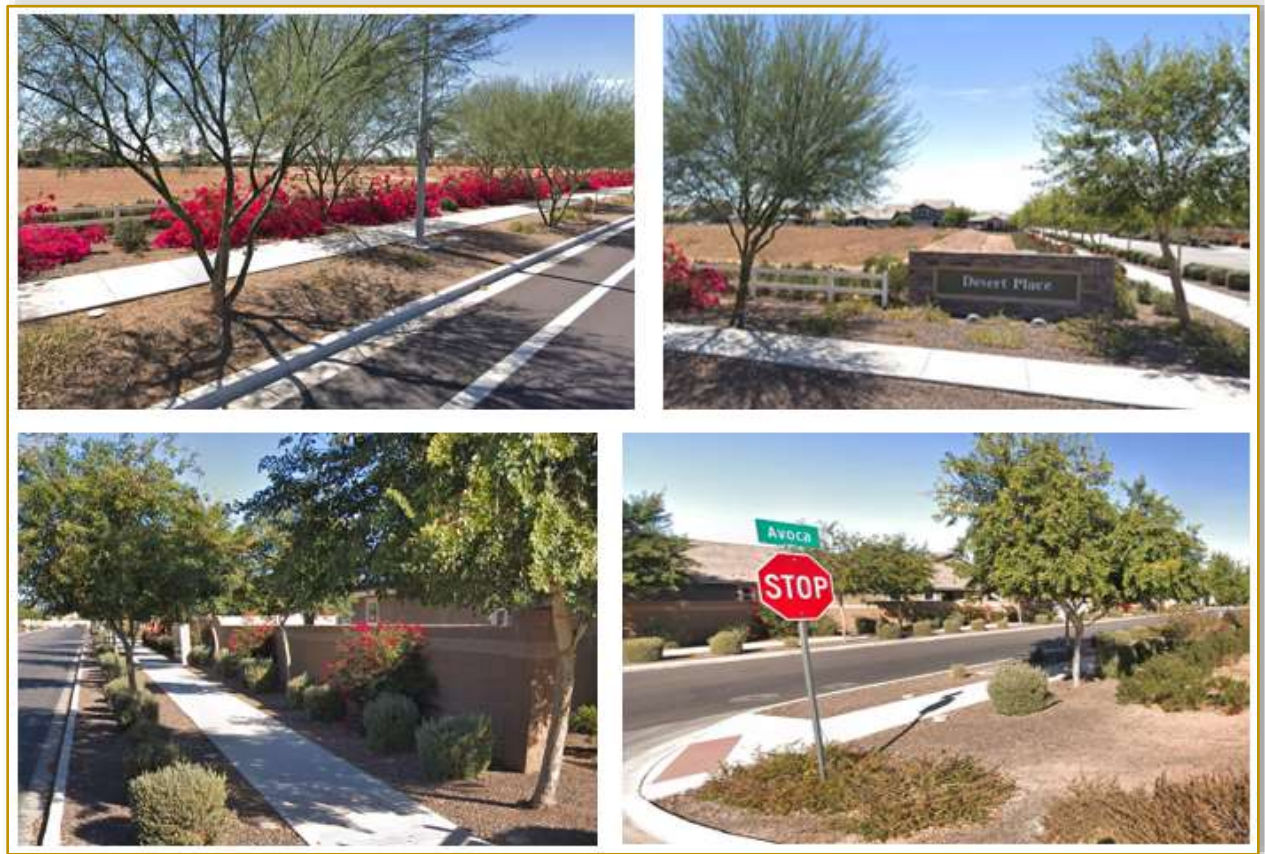
Figure 10 – Retention Tract Northeast of the Site (not a part)