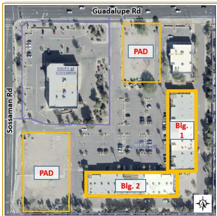
Figure 6 – Vacancies: SEC of Sossaman and & Guadalupe Roads