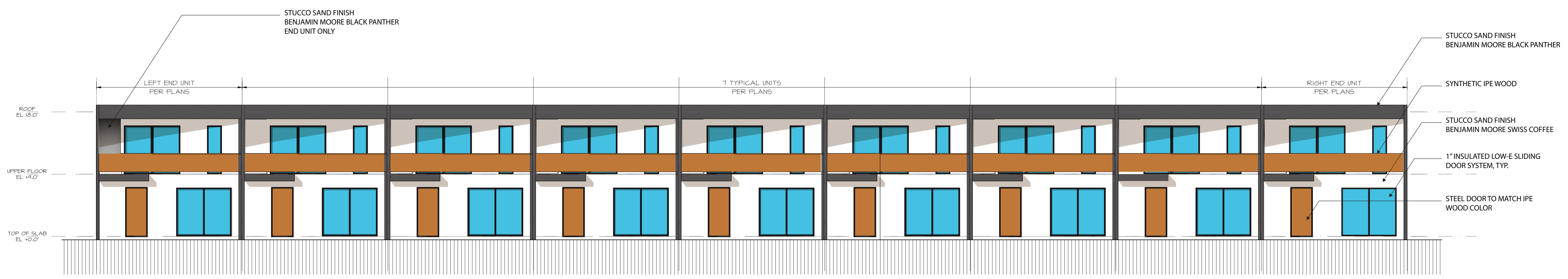
1 EAST ELEVATION (FACING CANAL)