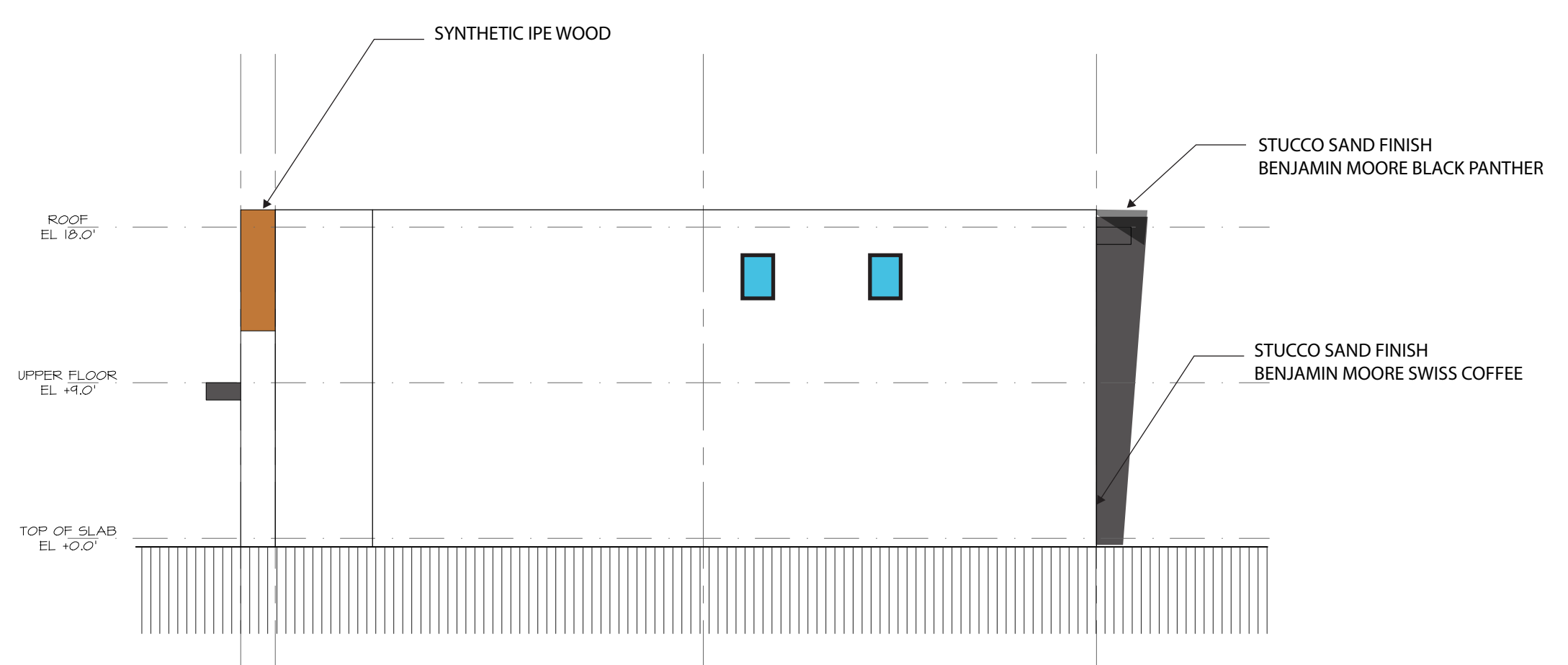
2 NORTH ELEVATION